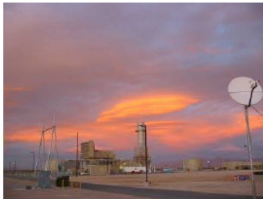
The Afton 7FA unit at sunset, 2003.