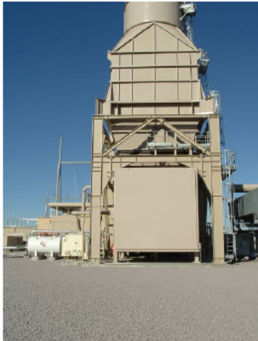
The Afton 7FA: let the work begin! 2005.