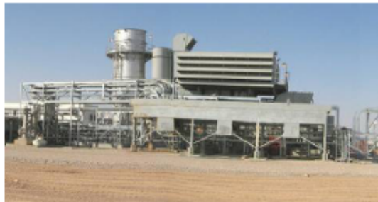
The Buzurgan LM6000 Project, Iraq, 2004.