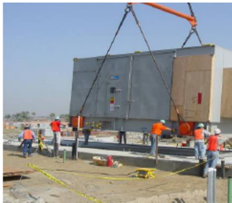
The generator lift at the City of Riverside, 2005.