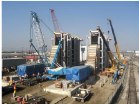
The Malburg Plant, Vernon, California, in 2004