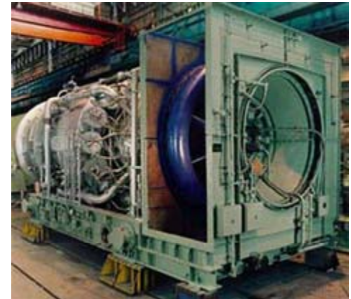
GE Frame 9E Combustion Turbine