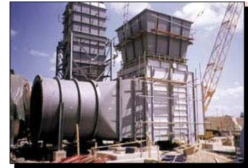
Siemens V94.3A Gas Turbine