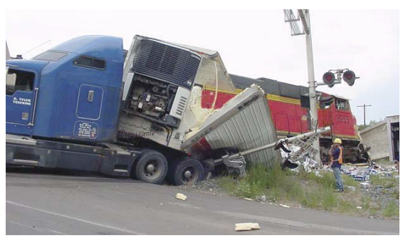
A beer truck got high-centered on this crossing prior to the collision.

A Nebraska man died of injuries suffered when the dump truck he was driving was hit by a train near Crescent, Iowa. The driver was injured during the collision as he tried to cross a highway-railroad grade crossing. Officials said the railroad crossing