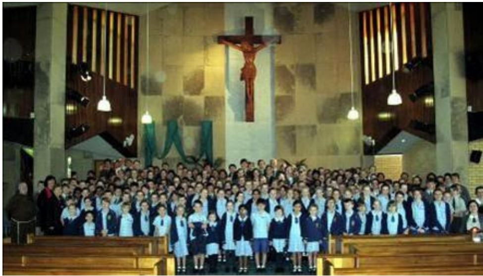
2011 Catholic Education Week, in July, combined FOTH Mass