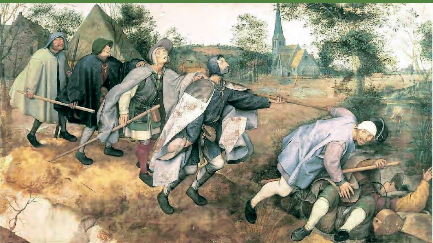
The Blind Leading the Blind (1568) - Pieter Bruegel the Elder

February 27, 2022 | Eighth Sunday in Ordinary Time (C)