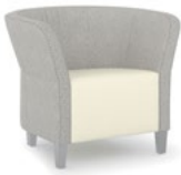
FLOCK ROUND LOUNGE CHAIR