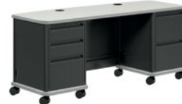
SMARTLINK MOBILE METAL DESK