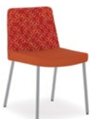
FLOCK CASUAL LOUNGE CHAIR