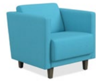
GROVE 1-SEAT LOUNGE CHAIR