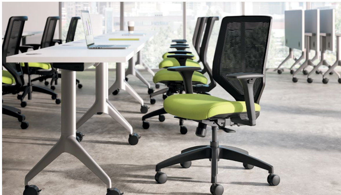
Featured Products Solve Task Chair, Ignition Multi-purpose Chair, Motivate Height- Adjustable Table, and Huddle Nesting Tables.