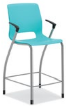
MOTIVATE COUNTER HEIGHT STOOL