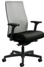
IGNITION TASK CHAIR