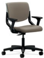
MOTIVATE TASK CHAIR