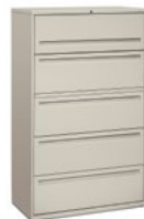
BRIGADE 700 SERIES LATERAL FILES