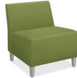
FLOCK MODULAR CHAIR