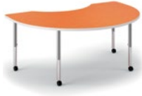
BUILD ARC TABLE