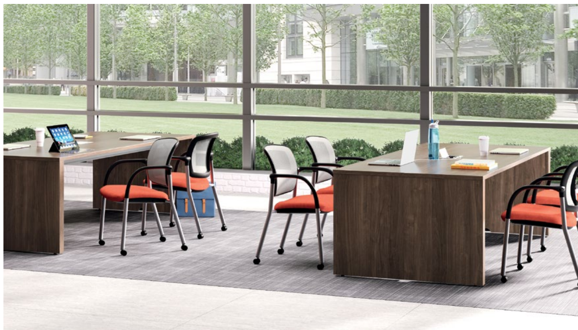
Inspired by HON color palette Wheat