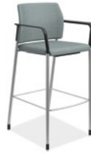
ACCOMMODATE CAFÉ HEIGHT STOOL