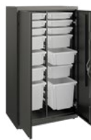
FLAGSHIP MODULAR STORAGE