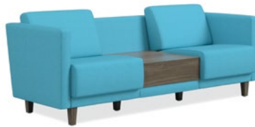
GROVE 2-SEAT W/ TABLE LOUNGE CHAIR