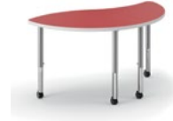
BUILD WISP TABLE