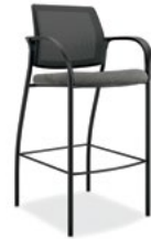
IGNITION CAFÉ HEIGHT STOOL