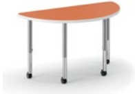
BUILD HALF-ROUND TABLE