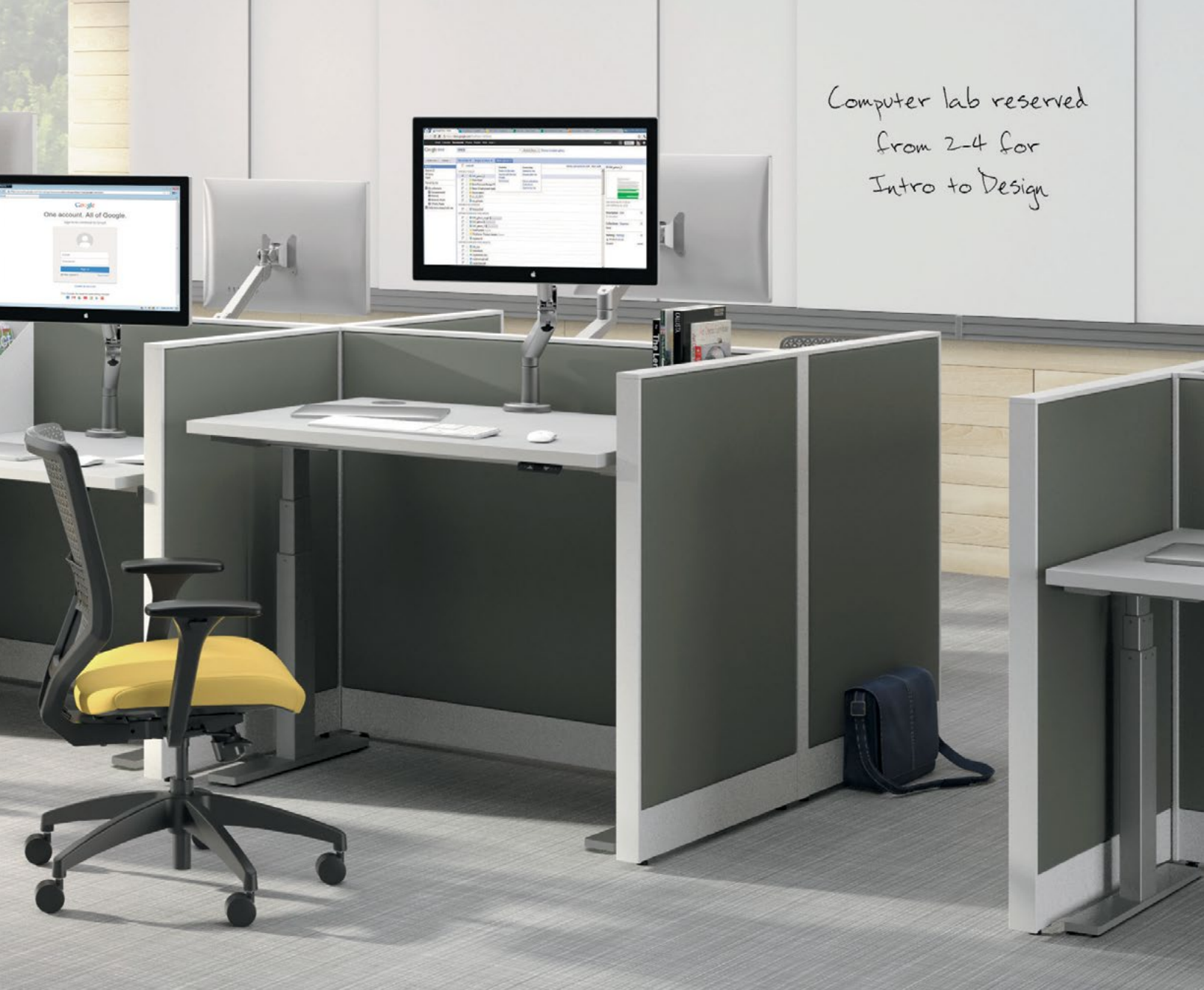
Featured Products Solve Task Chair, Coordinate Height- Adjustable Base, Dual Monitor Arm.

Computer lab reserved from 2-4 for Intro to Design