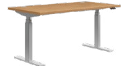
COORDINATE HEIGHT-ADJUSTABLE BASE