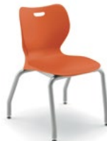
SMARTLINK 4-LEG CHAIR