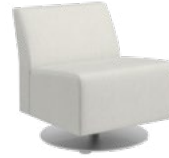
FLOCK MODULAR CHAIR W/ SWIVEL BASE