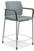
ACCOMMODATE COUNTER HEIGHT STOOL