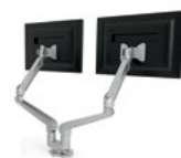
MONITOR ARMS DUAL