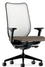
NUCLEUS TASK CHAIR