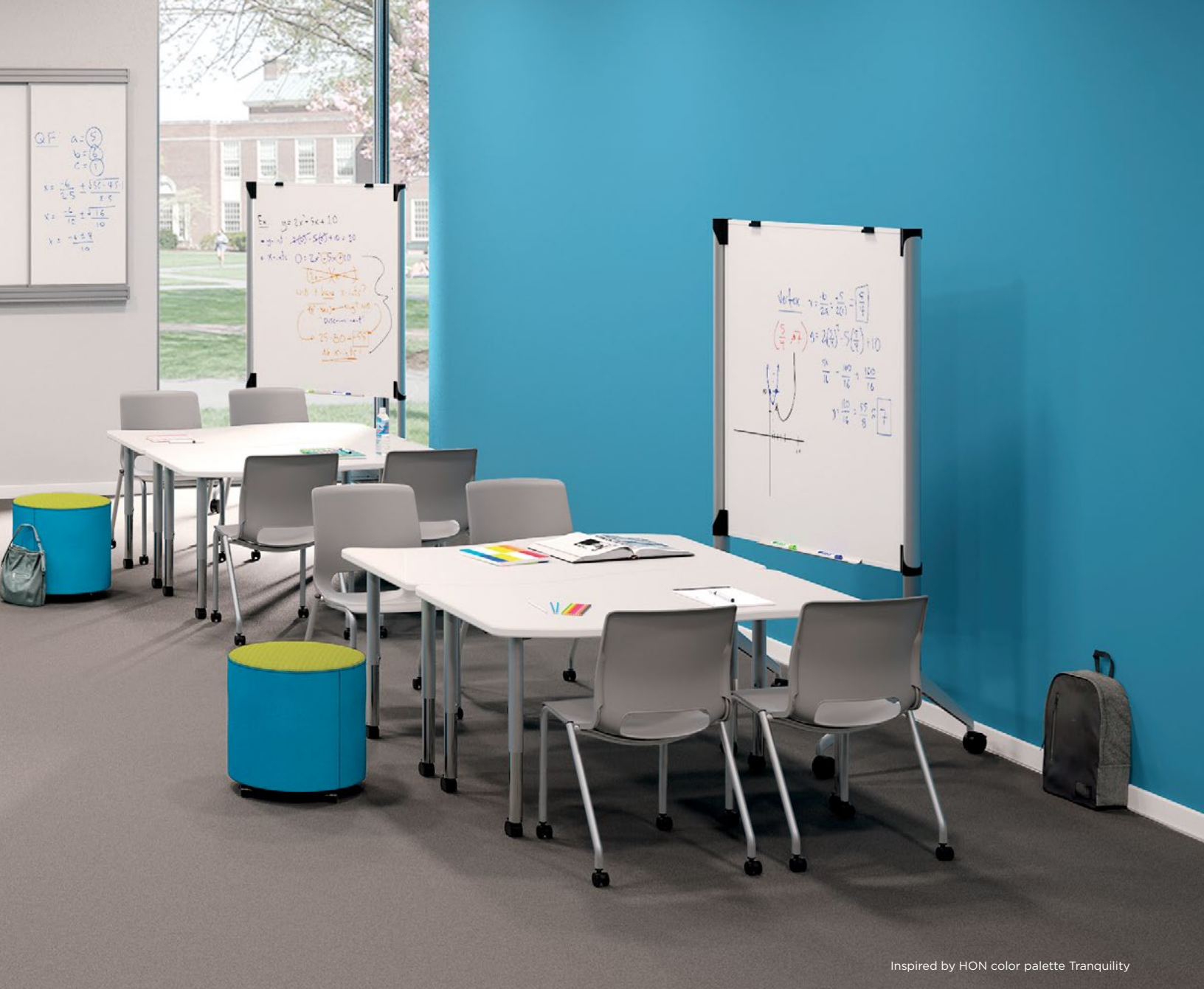
Inspired by HON color palette Tranquility