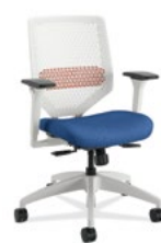
SOLVE TASK CHAIR