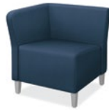
FLOCK MODULAR END