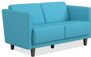
GROVE 2-SEAT LOUNGE CHAIR