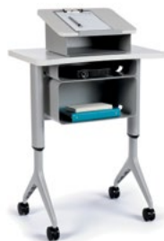
Featured Products Motivate Presentation Cart, Nesting/Stacking Chairs, and Build Ribbon Table.