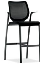
NUCLEUS CAFÉ HEIGHT STOOL