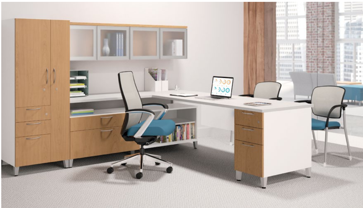
Featured Products Endorse Task Chair, Coordinate Height- Adjustable Base, Accommodate Casual Guest Chair and Contain Storage.