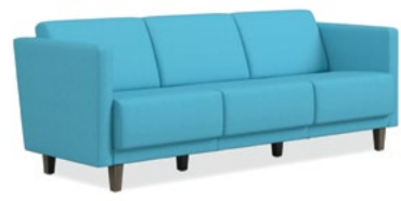
GROVE 3-SEAT LOUNGE CHAIR