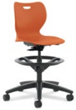
SMARTLINK TASK SWIVEL STOOL