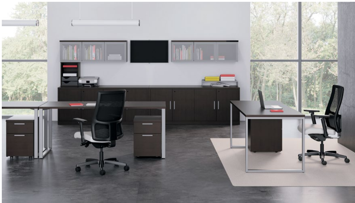
Featured Products Ignition Task Chair, 10500 Series Desk, Contain Mobile Pedestal, Ignition Multi-purpose Chair and Contain Storage Tower.