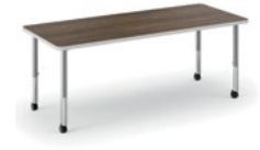
BUILD RECTANGLE TABLE