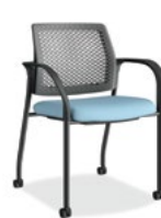
IGNITION MULTI-PURPOSE CHAIR