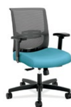
CONVERGENCE TASK CHAIR