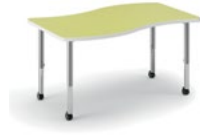
BUILD RIBBON TABLE