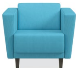
Featured Products Grove 1-Seat, Arrange Table, Flock Mini Cylinder, and Preside Collaborative Table.