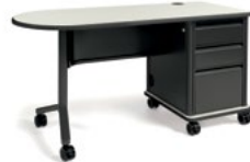
SMARTLINK TEACHER STATION