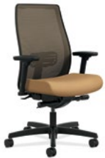
ENDORSE TASK CHAIR