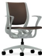
PURPOSE TASK CHAIR