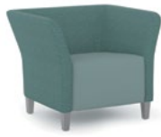
FLOCK SQUARE LOUNGE CHAIR