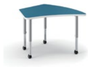
BUILD KITE TABLE