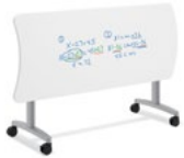
BUILD DART NESTING TABLE