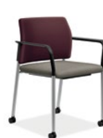
ACCOMMODATE GUEST CHAIR