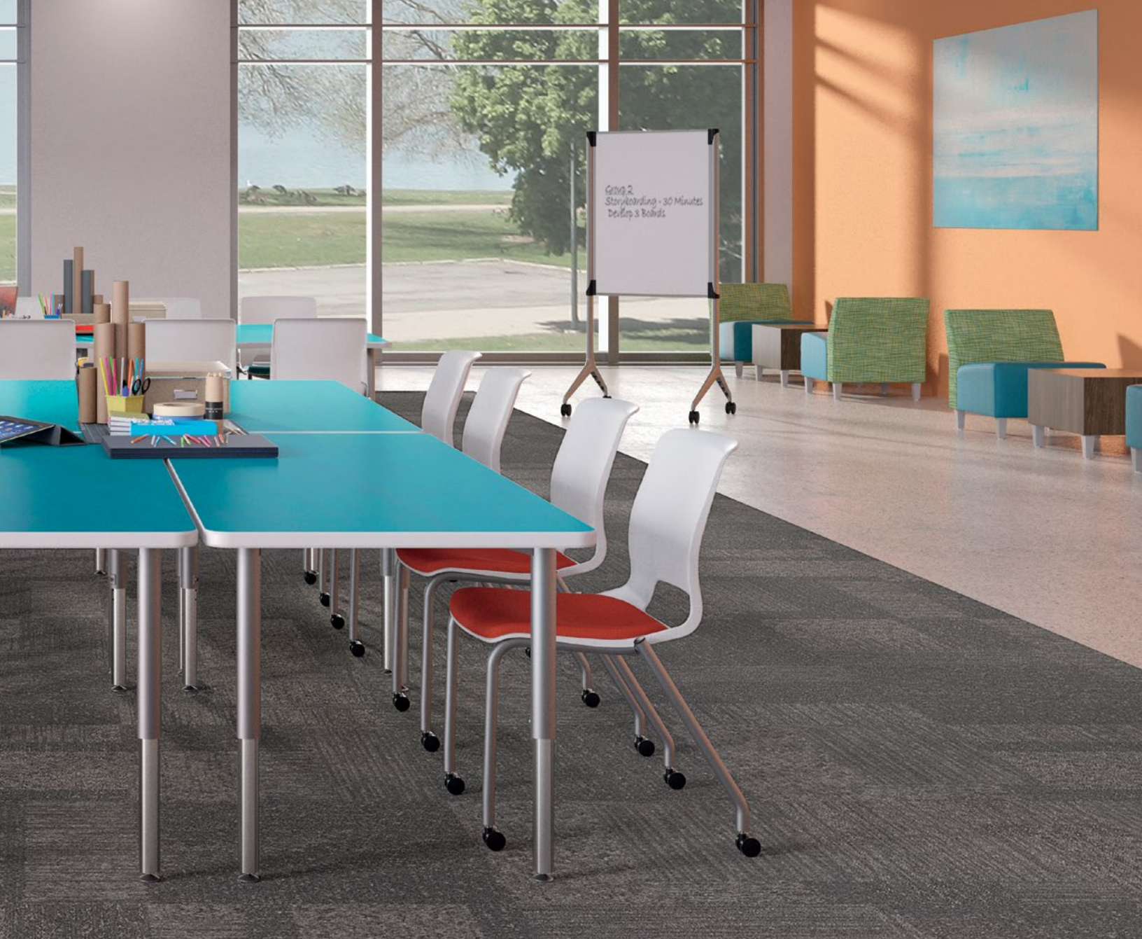
Featured Products Flock Lounge Chair, Collaborative Table with Power, SmartLink Modular Storage Cabinet, Build Rectangular Table, Motivate Stacking 4-leg Chairs and Mobile Markerboard.