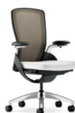
CERES TASK CHAIR