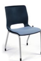
MOTIVATE 4-LEG STACKER