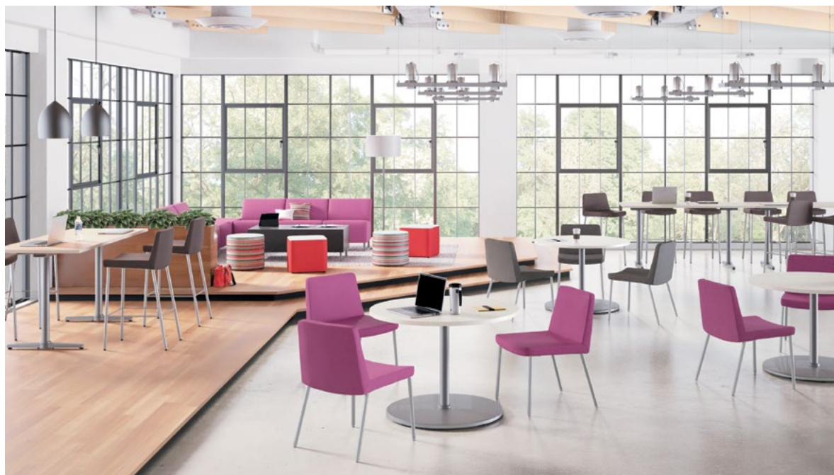
Featured Products Accommodate Stool, Arrange Table, Motivate 4-Leg Stacking Chairs and Flock Lounge Chair.