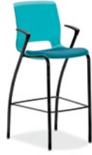
MOTIVATE CAFÉ HEIGHT STOOL