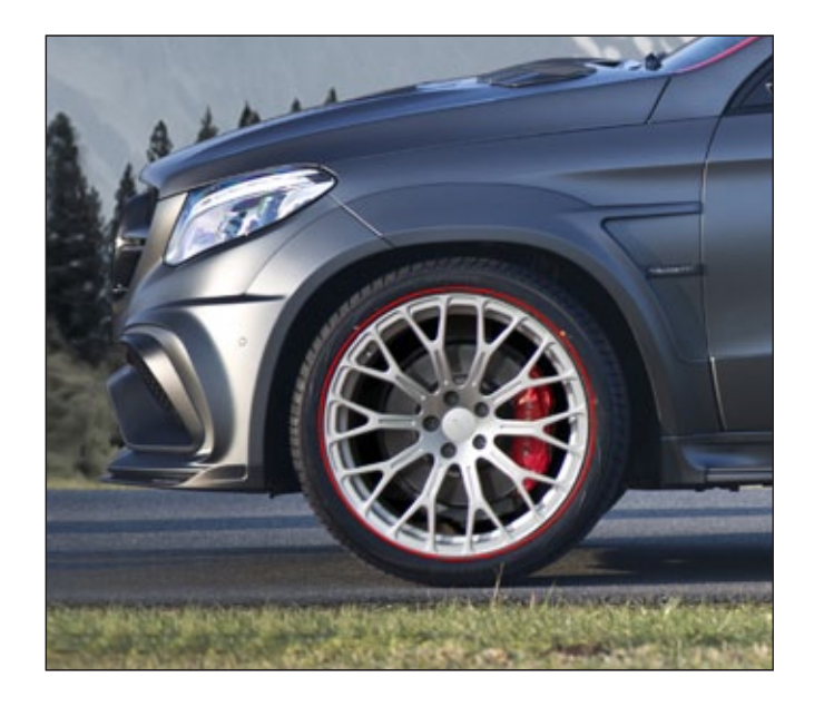
The MANSORY Y.10 fully forged light weight alloy wheel