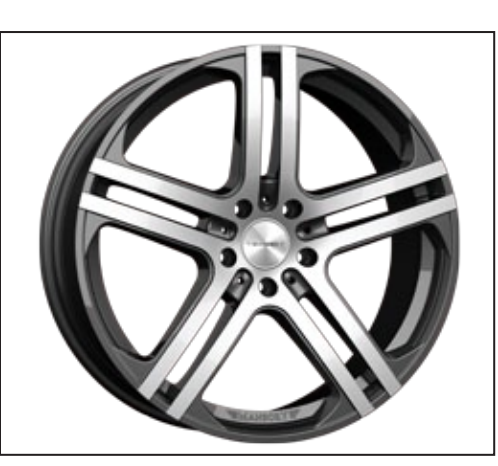
N.50 Wheels - BLACK DIAMOND