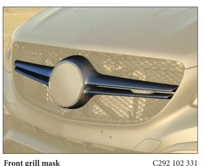
Front grill mask visible carbon fibre glossy*

Air outtake splitter for OEM bonnetC292 210 7512 parts set - left & rightvisible carbon fibre glossy*① compatible only original engine bonnet