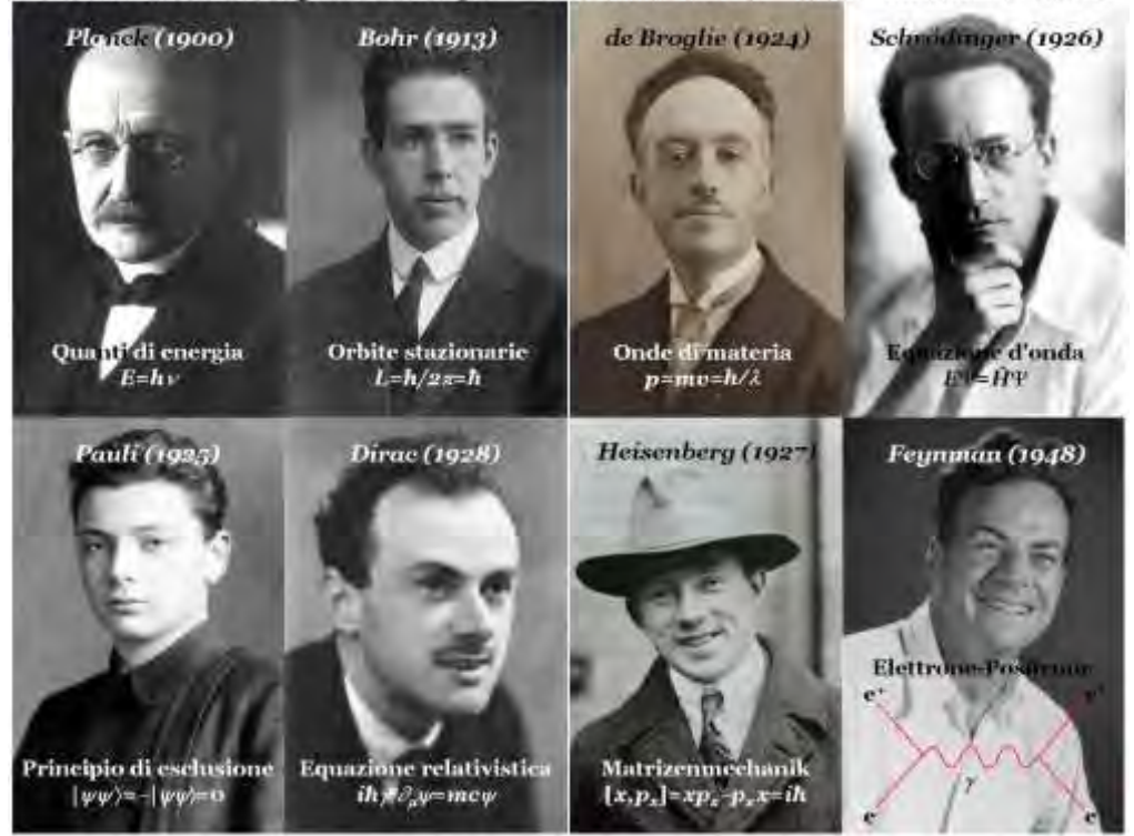
Figure 1. The 2013 poster on Quantum Physics by Enzo Bonacci "Perché nessuno capisce la M.Q.?" – Prof. Enzo Bonacci – Liceo "G.B. Grassi" Latina

date literature (Par. 2) are retrieved from current Italian institutional and sectorial websites.