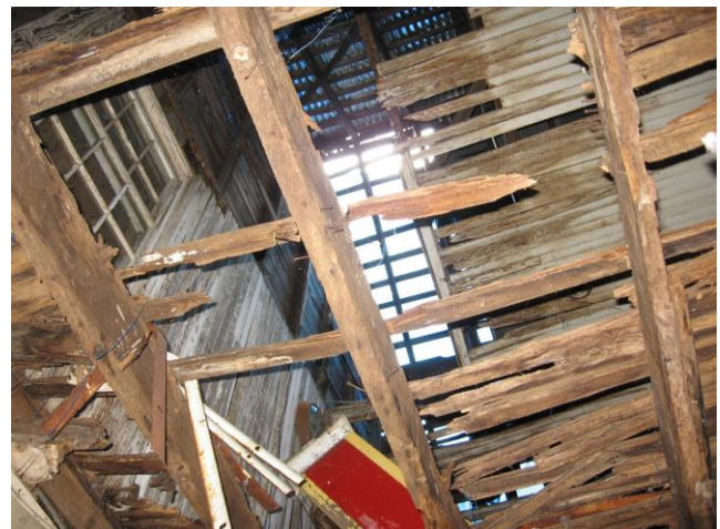
Above: The lodge in 2007, prior to stabilization.