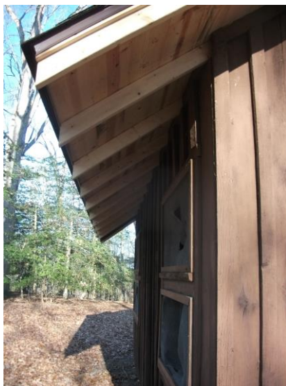
Below: Restoration of the individual cabins is in keeping with their rustic character.