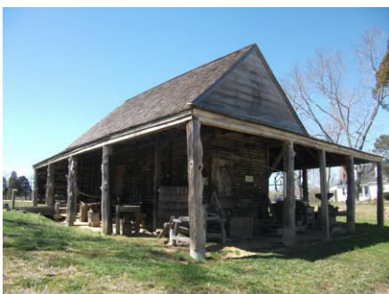
Left: The corn crib before restoration.