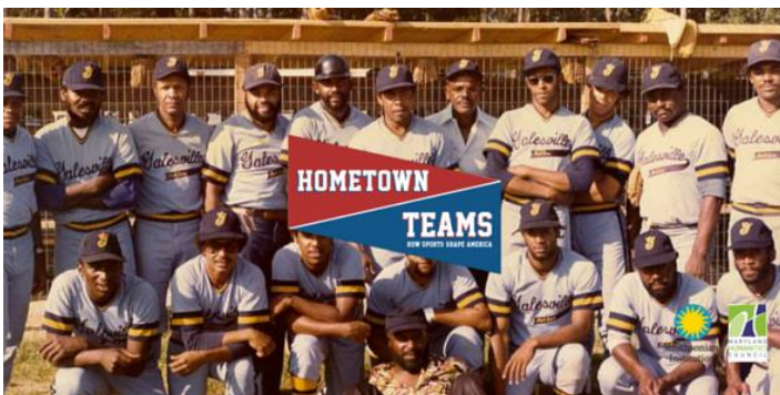
Above: "Hometown Teams", a traveling exhibit of the Smithsonian Institution, came to Galesville to celebrate the 100 th anniversary of the Galesville Hot Sox (pictured).

Funds from the African American Heritage Preservation Program in FY2013 and FY2015 assisted the stabilization of the Wilson Farmstead for a future community use.