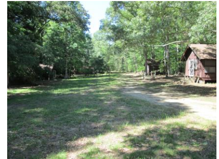
Above and left: The cabins and the “Camp Mohawk” site in Kings Landing Park.