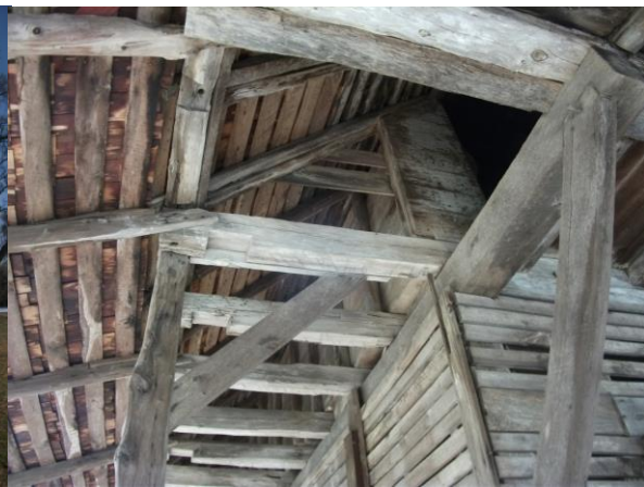
Above left and center: The corn crib's shingles before and after restoration.