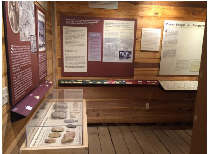
Above: The completed "Land, Lives, and Labor" exhibit in the historic corn crib.