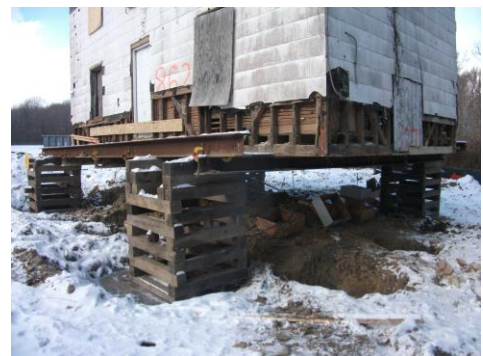
Above: Stabilization of the structure involved lifting it to repair the framing and replace the foundation.