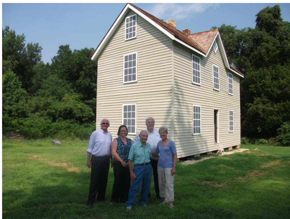
Wilson Farmstead, Galesville, Anne Arundel County

Maryland Commission on African American History and Culture 84 Franklin Street Annapolis, MD 21401 www.africanamerican.maryland.gov