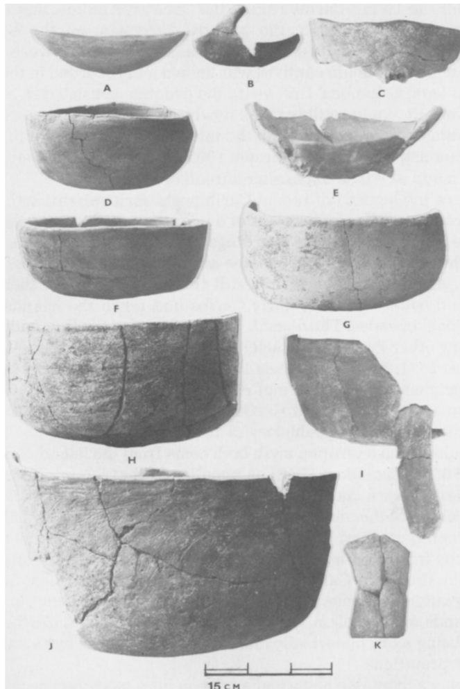
Figure 1. Suazoid pottery vessels from the Macabou site, Martinique.

Despite various theories, the most plausible archaeological culture or people in the Lesser Antilles to be correlated with the Island Caribs is the Suazoid series. The extremely crude ceramics associated with the culture and its late occurrence—radiocarbon dated to between AD 1100 and just before the arrival of Columbus—make it a tempting correlate of the historic people (Figure 1). There is as yet, however, no evidence of a historic contact site that would establish this correlation on empirical grounds, and the post-1500 radiocarbon dating of the complexes is still inconclusive (Bullen and Bullen 1972; also see Allaire 1977).