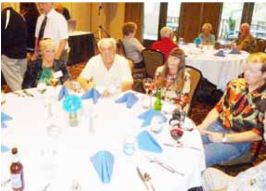
A fine looking table at the Saturday dinner