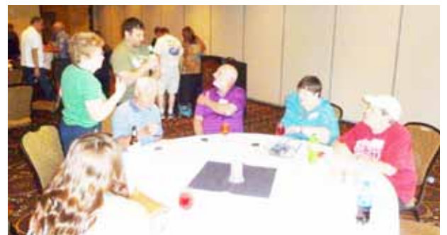
So, when is the card game?