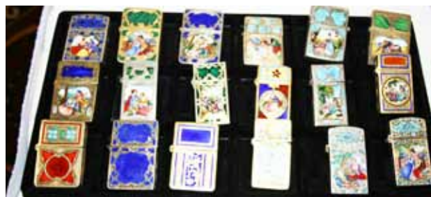
A most beautiful array of Italian Enamel from Maya.