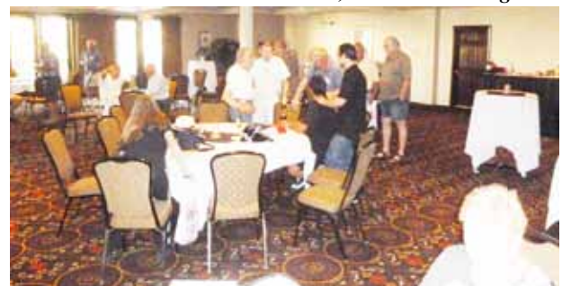
Happy hour / meet & greet