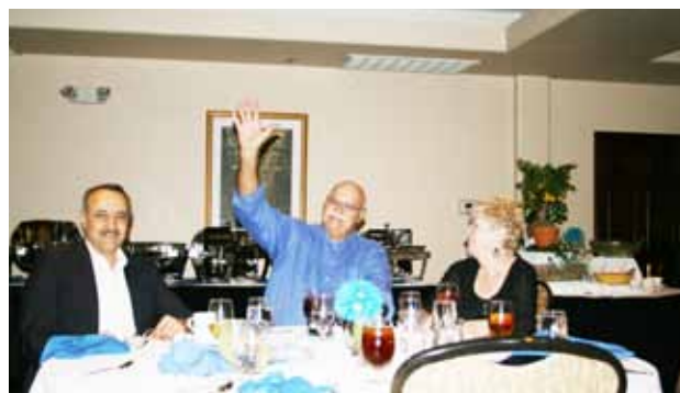
Good Night Everyone, till next year!