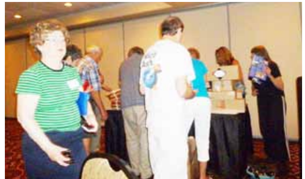
Purusing the auction table