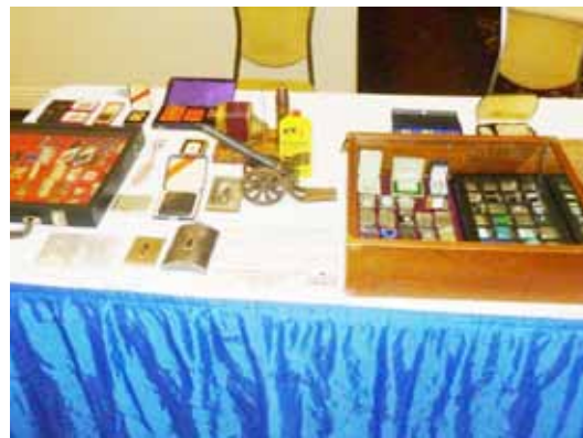
Some of Bob Rogers great show pieces