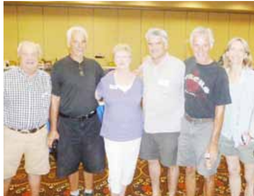
A group hug