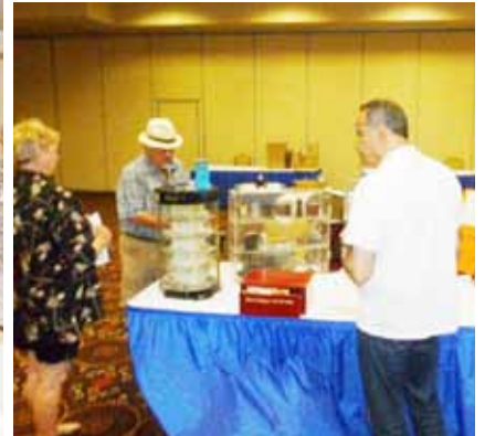
The Gynes's setting up