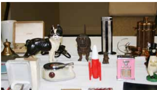
Only at a lighter show can you find such an array!