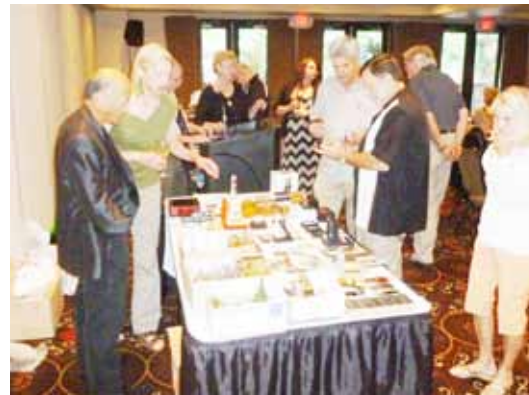
Everyone deciding what to bid on