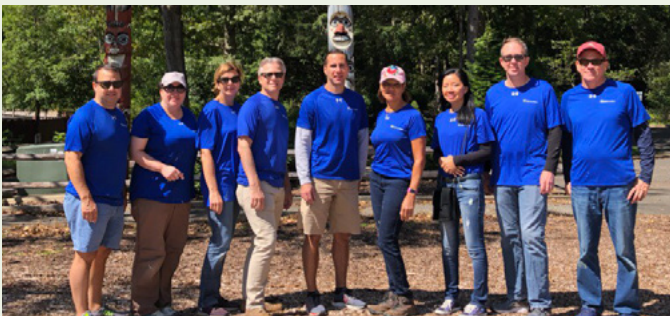
Volunteers from MBIA helped us with important projects.