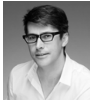
Stéphane Lasserre Principle Architect

The development consists of 3 buildings staggered along an axis that gives a strong direction to the massing. This axis was set in such a way that all the living areas and master bedrooms can face a green open space and the sunset. Since the towers form an angle with the main roads, it creates a dynamic experience as the character of the development will change depending from where we look at it.