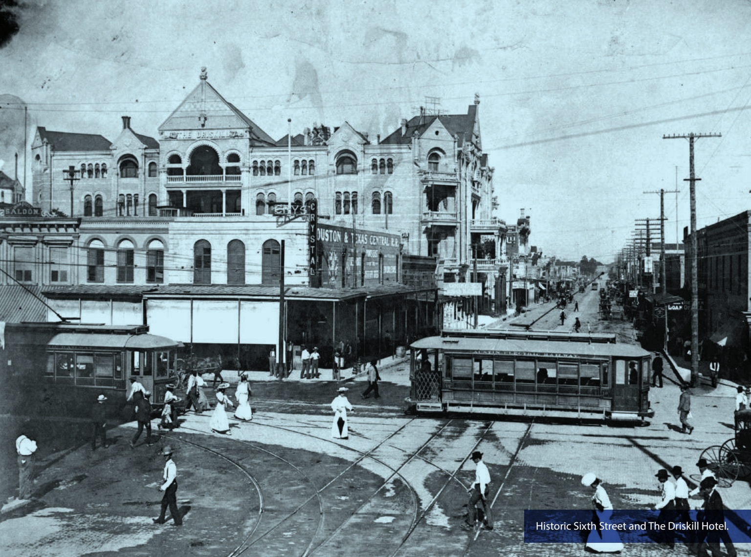
Historic Sixth Street and The Driskill Hotel.