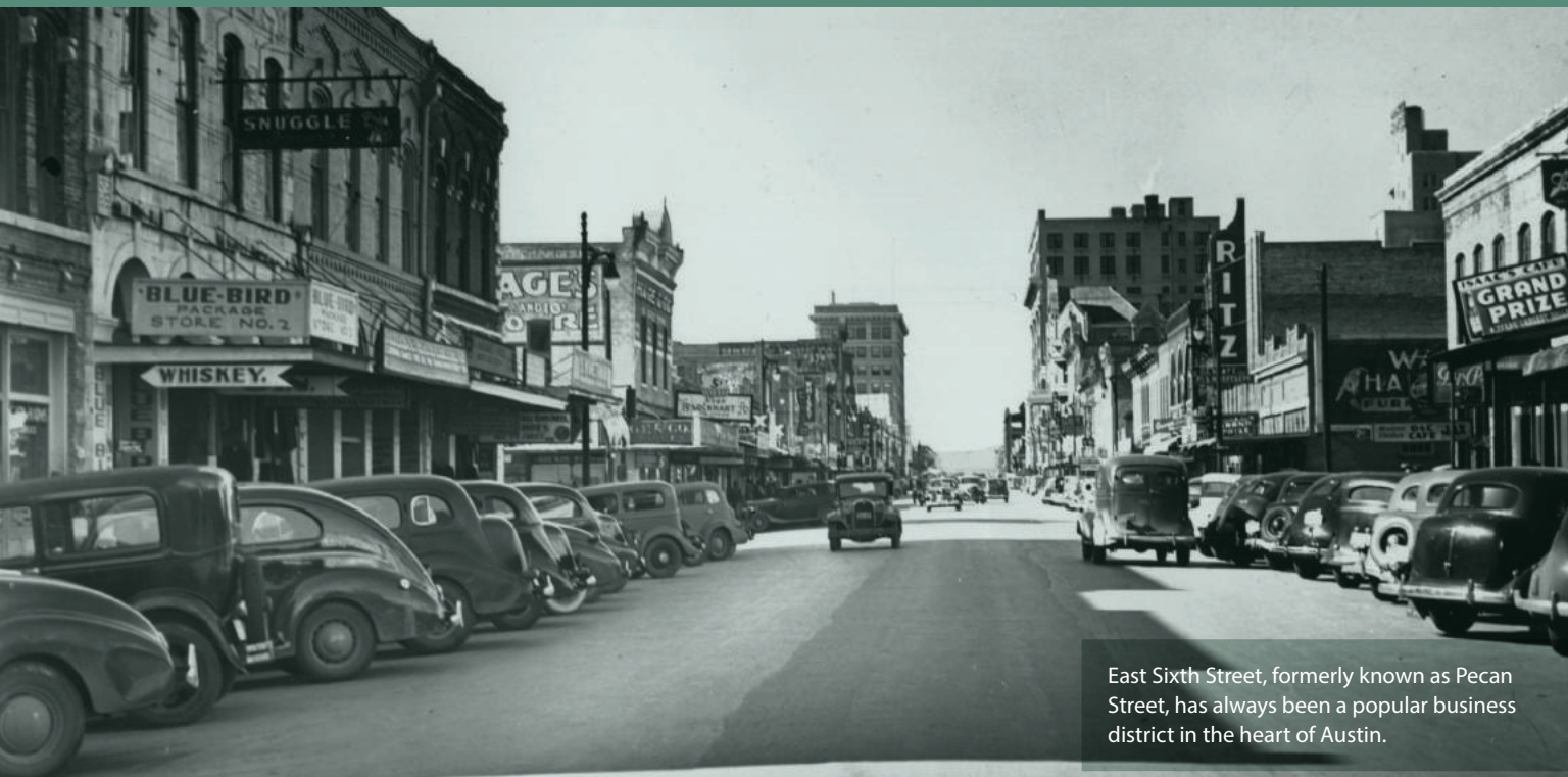
East Sixth Street, formerly known as Pecan Street, has always been a popular business district in the heart of Austin.