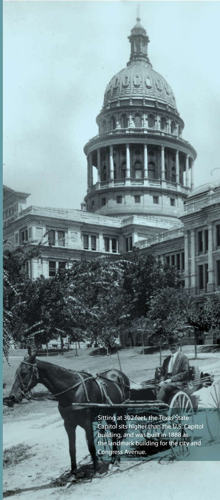
Sitting at 302 feet, the Texas State Capitol sits higher than the U.S. Capitol building, and was built in 1888 as the landmark building for the city and Congress Avenue.

Symphony Square is a collection of 1870s Texas vernacular stone buildings, brought together by the Austin Symphony Orchestra. 1101 Red River St. austinsymphony.org . One block away is the 1857 German Free School building, home of the German-Texan Heritage