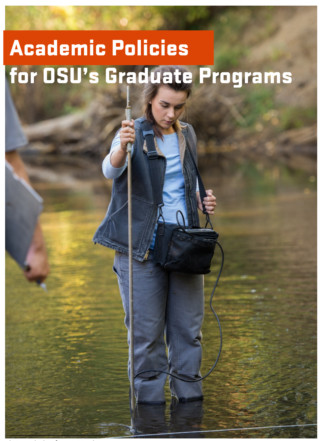
<sup>2</sup> Material taken from OSU websites