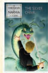
The Silver Chair