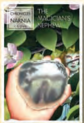
The Magician's Nephew

Enter the World of Narnia with these riveting paperback editions from HarperCollins Children's Books!