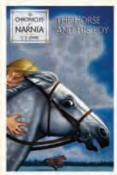
The Horse and His Boy