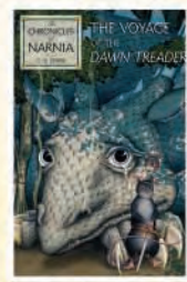
The Voyage of the Dawn Treader