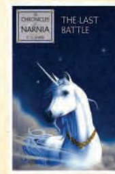
The Last Battle