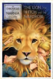
The Lion, the Witch and the Wardrobe