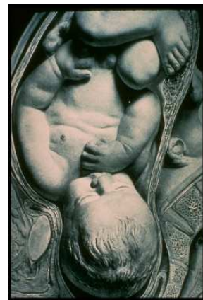
Figure 2 In the Womb

At the onset of biological birth the uterus begins to contract, and the cervix has not opened yet. Each contraction restricts the supply of arterial blood and thus oxygen supplying the placenta. It involves overwhelming feelings of increasing anxiety and awareness of an imminent vital danger. Symbolically this can be cosmic engulfment – no exit, Hell.