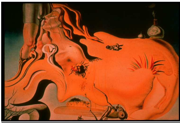
Figure 6 The Great Masturbator , Salvador Dali.

In experiences associated with this matrix sexuality may be connected with apprehension of danger and death, anxiety, aggression, self-destructive impulses, physical pain and sensations of biological material (blood, mucus, feces, urine). This matrix forms a natural basis for development of the most important types of sexual dysfunctions, deviations, and variations.