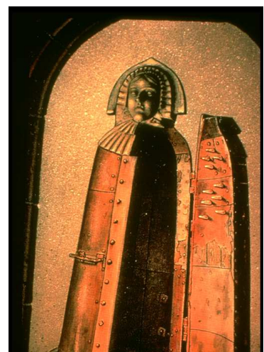
Figure 4 The Iron Maiden

The influence of this matrix can give rise to multiple archetypes of torture.