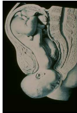
Figure 5 Passage through the Birth Canal

This matrix corresponds to the second clinical stage of childbirth. The uterine contractions continue, but the cervix is now dilated and allows gradual movement of the fetus through the birth canal. This involves a critical struggle for survival, crushing mechanical pressures and often a high degree of anoxia and suffocation.