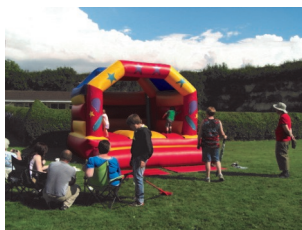
2012 Fun day