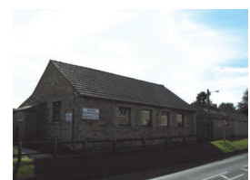
Swinton Reading Room And Community Hall

For any information or to make a booking please contact Dianne on 01653 697548