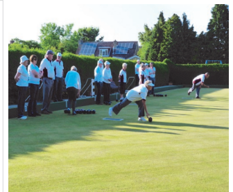
Hovingham League Players in Action