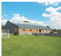
BSA Sports Centre