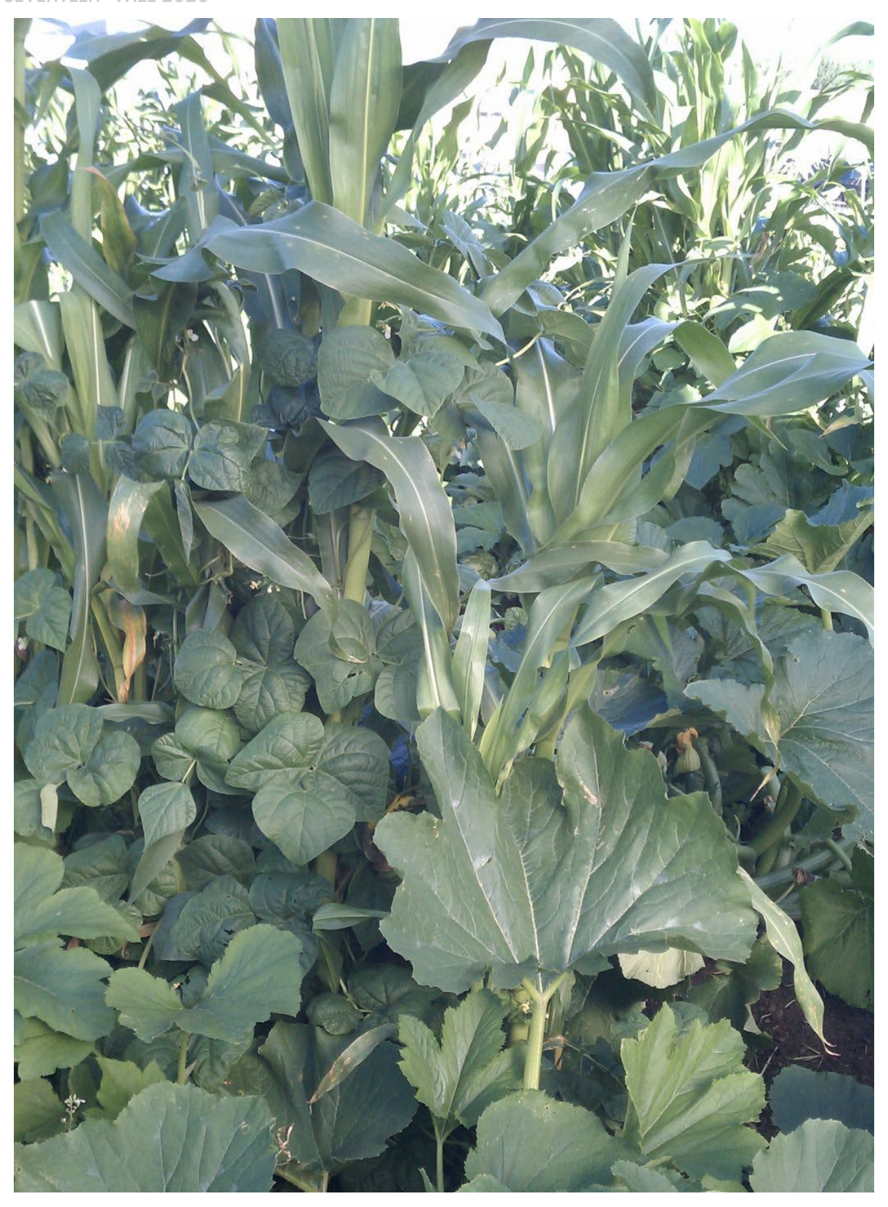
"Three Sisters" garden of corn, beans, and squash.