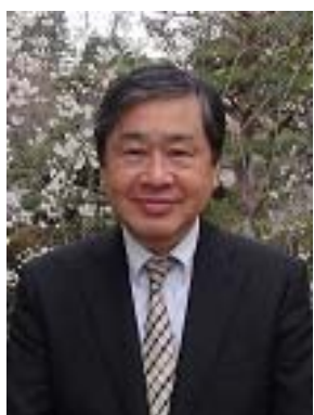
Prof. Taiji Hagiwara

A group of Japanese big companies began to request the conclusion of the Japan-EU EPA/FTA in the middle of the 2000s. After 18 negotiation rounds starting in 2013, the Japan-EU EPA/FTA was finally signed in July 2018, and came into effect in February 2019. The European Commission estimated the Japan-EU EPA/FTA would increase the EU's GDP and bilateral exports by 0.14% (33.9 bil. euro) and 13.2% (13.5 bil. euro) respectively. The Japanese government also estimated that the EPA/FTA would raise Japanese real GDP by 0.99% (5.2 tril. yen). Furthermore, the Japan-EU SPA also provisionally came into effect in the same month. Although It is too early to give a final conclusion on the impacts of the Japan-EU EPA/FTA and SPA, my presentation will first of all outline the agreement and show some short-term results of the EPA/FTA using trade data. Secondly, the Japan-EU EPA/FTA and SPA cover the trade and security relationships between the third biggest country economically and the largest economic region. Therefore these agreements shall have various effects on other mega FTA negotiations and WTO reforms, and on global geopolitical and security situations (especially in the East Asia). My presentation will start a discussion on the dynamic impact of the Japan-EU EPA/FTA and SPA.