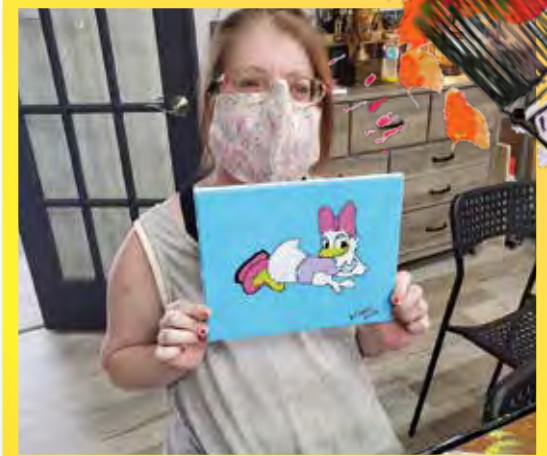
Do you recognize who Brooke S. painted a picture of?