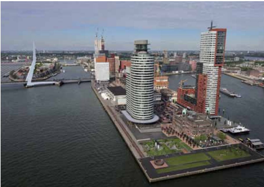
South Bank Rotterdam.

This ISECS Congress is organized by the Organizing Committee of Dutch-Belgian Society of Eighteenth-Century Studies and is hosted by the Erasmus University Rotterdam. During the Congress there is an ordinary meeting of the ISECS General Assembly. Opening Markets includes theme-related sessions as well as plenary sessions featuring