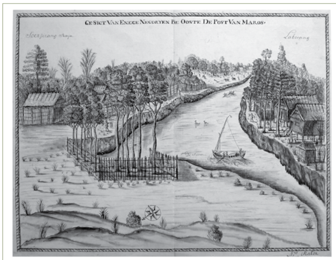
Unknown artist (circa 1750), Trading station of the Dutch East India Company at Celebes (Sulawesi).

The early modern economic and financial re-organization also had its effect on the cultural, literary and artistic production. Economic activity is depicted and commented upon in art and literature. The merchant and his family grew out to be important characters in novels and plays, economic success and crises became the motors of plots and a source of humor. The Financial ‘Bail outs’ of 1720, ‘paper revolutions’, spurred an international, speculative trade in pamphlets in which the cultural consequences of the new financial system were researched and ridiculed. Through literary and artistic images, new metaphors were developed which could better describe the new financial aspects and organization. How could ‘good trade’ be distinguished from ‘bad’ or immoral economic behavior? The eighteenth century can be seen as the birthing ground for the metaphor of the ‘marketplace of ideas’, which in the twentieth century would grow out to be one of the most important metaphors to describe the organization of modern society.