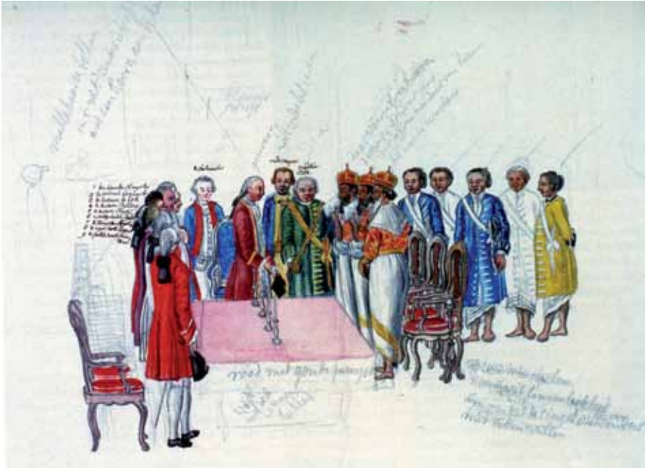
Jan Brandes (1785), Reception by Governor Falck of the Candian Ambassadors in the Audience Hall at Colombo.