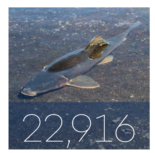
fish handled during our second research season