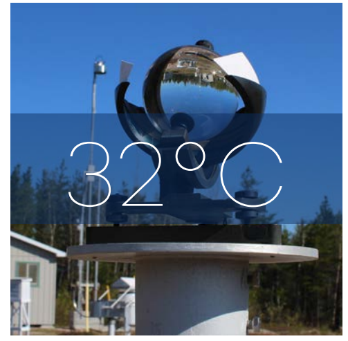
highest temperature recorded this year on August 15. (The highest temperature ever recorded at IISD-ELA is 37°C)