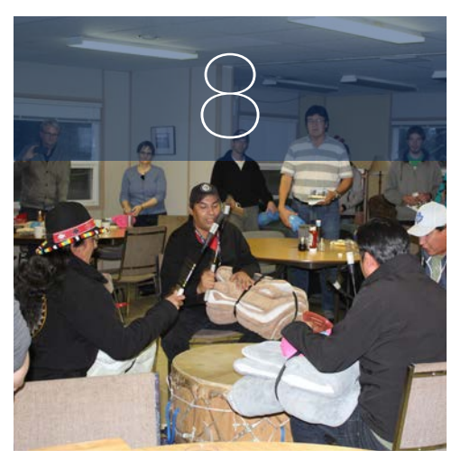
First Nations communities who participated in our Fall Feast (in October 2015)