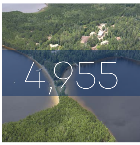
person-days of IISD-ELA site usage during the 2015 research season