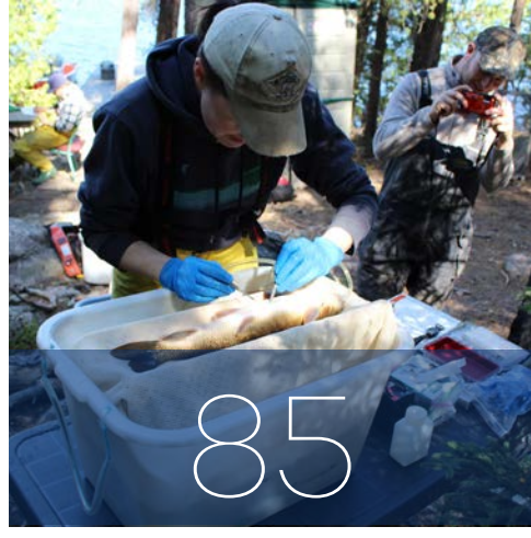
number of fish surgeries (implantation of acoustic tags) performed