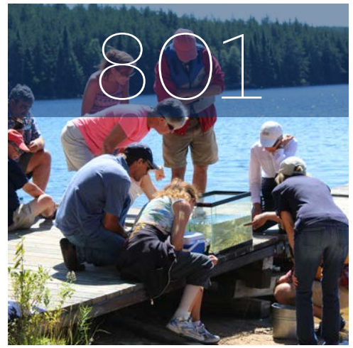
people engaged through IISD-ELA education and outreach activities including tours and off-site presentations and symposiums