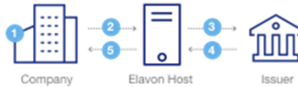
Figure 2-1. Authorization Process

The following diagram describes the electronic authorization process: