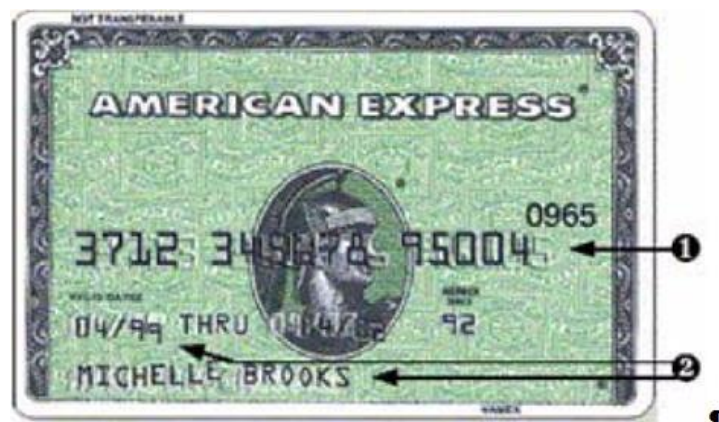
Figure 4-5. Example of Fraudulent Embossing