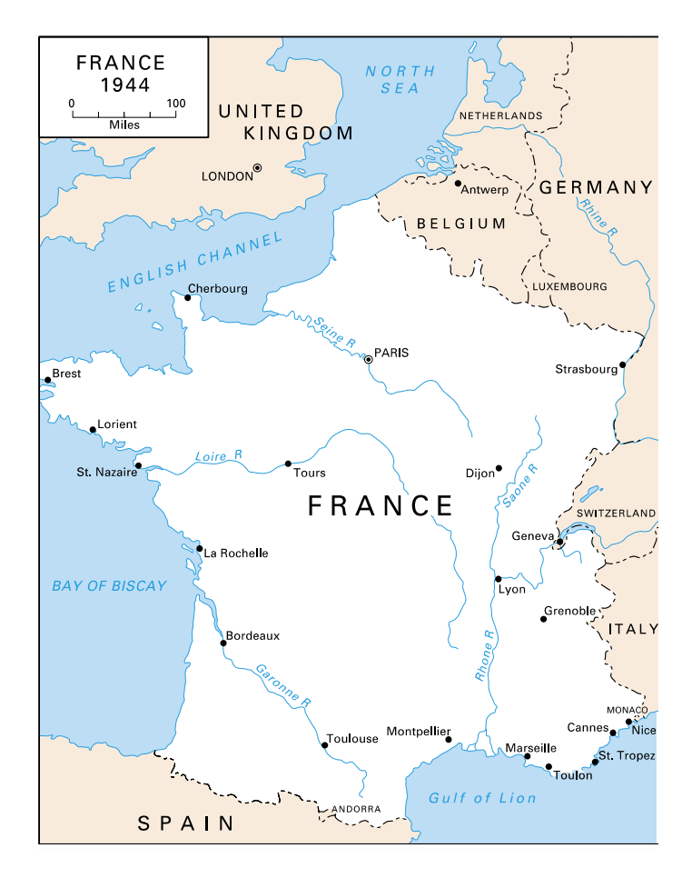
Figure 1. France 1944. Center of Military History (CMH 72-31), Southern France (Washington, DC: Government Printing Office, 2012), 5.