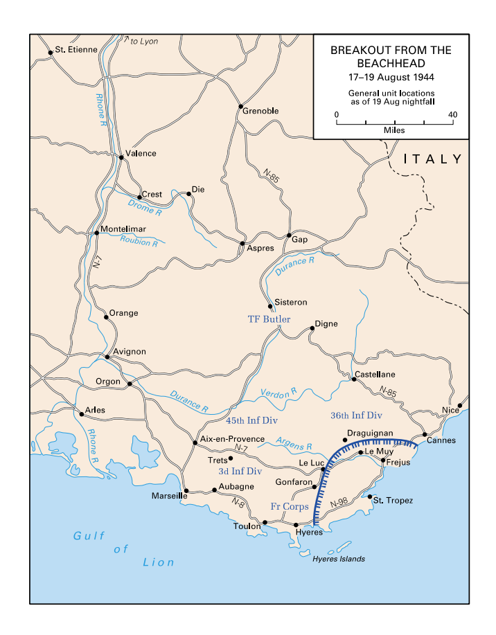
Figure 3. Breakout from the Beachhead. Center of Military History (CMH 72-31), Southern France (Washington, DC: Government Printing Office, 2012), 18.

During this time, General Lucian Truscott ordered the assembly of TF Butler. In July during the planning for the operation, Truscott decided to organize a small mobile strike force after the landings. It provided the army flexibility during the assault. It assembled on the night of August 17 and moved north heading toward Grenoble. By the 19th it was fifty miles north of the 45th Division conducting a reconnaissance-in-force. Its end state would be to move north and then cut west to block the narrow Rhone corridor. It was risky, but within three days, TF Butler drove over 100 miles and was in position at Gap and Aspres to cut off the German forces retreating. Receiving news that the Germans were retreating, Truscott split the campaign into three parts. The first was the conquest of Toulon and Marseille, the second continued to drive west, securing the west flank, and finally TF Butler moved to the north, to be directed behind the