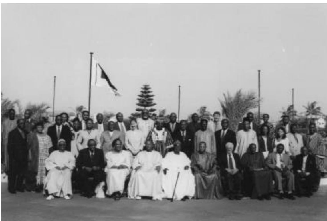
Participants at the IPA/ECOWAS task force meeting, Dakar, Senegal, August 2002

quickly provided by the donor community, instability could return to Guinea-Bissau. After a fact-finding mission to Guinea-Bissau between 9 and 16 November 2002, the United Nations Ad Hoc Advisory Group of the Economic and Social Council on Guinea-Bissau reported that the increased involvement of external donors is crucial to averting the country's relapse into war and to improving its deteriorating social and economic situation 79 .