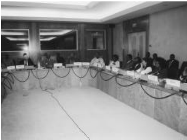
Participants at the IPA/ECOWAS task force meeting on "Operationalizing the ECOWAS Mechanism for Conflict Prevention, Management, Resolution, Peacekeeping, and Security" August 2002, Dakar, Senegal

– Guinea, Liberia, and Sierra Leone – could help defuse the present insecurity in the area. In proposing a resolution for the crisis in Guinea-Bissau and Senegal's Casamance region, particular attention was drawn to the UN Secretary-General's April 1998 report, which recommended that African countries should expose the names of weapons dealers and complicit states. 55 ECOWAS was urged to use this approach and to work more closely with the UN's disarmament offices in Lomé (Togo) and Bamako (Mali).