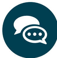
THE OPTAVIA COMMUNITY