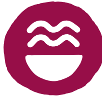
HEALTHY EATING & HYDRATION