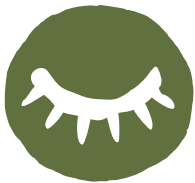
HEALTHY SLEEP & ENERGY MANAGEMENT