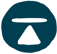
HEALTHY WEIGHT MANAGEMENT