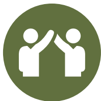
YOUR OPTAVIA COACH

This will allow them to have the passion and energy to want to become more competent and develop their skill and ability to lead their own journey to optimal health and wellbeing. To help build that mastery, we guide them to the four components that we have found create predictable transformation.