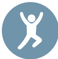
THE HABITS OF HEALTH TRANSFORMATIONAL SYSTEM