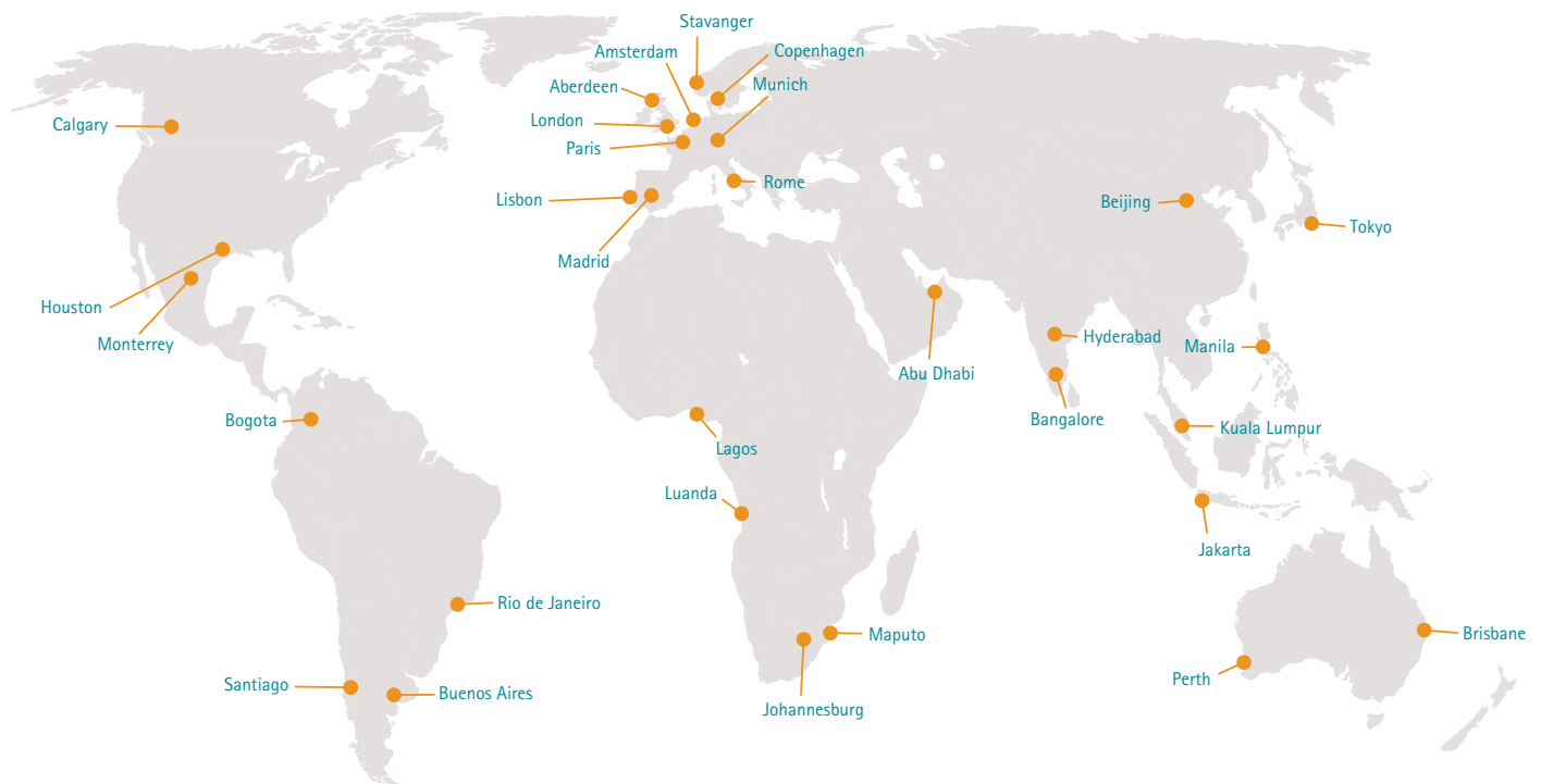
Figure 2. Accenture Energy Hub Network.

Accenture has created Energy hubs located in energy-centric locations around the world. The purpose of the hubs is to serve as a network to quickly respond to client needs, package local thought leadership to highlight emerging trends and test Accenture's industry assets for client relevance.