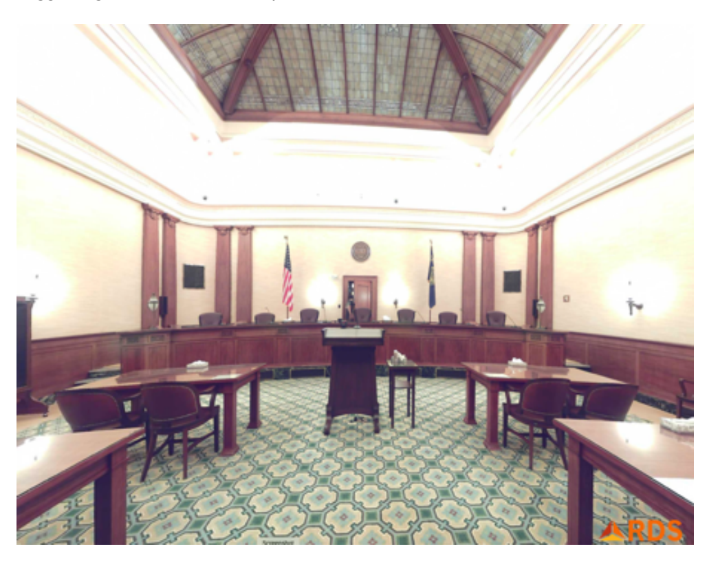
Photo: In courtroom looking toward judges' bench. Photo shows carpet prior to removal. Walls on left and right with sconces are also available for artists' consideration. Approximate wall dimensions are 25 feet wide by 11 feet high. The yellow wall color will be updated to be a lighter, more neutral white. (Notice decorative stained-glass skylight partially visible above).

The carpet in the courtroom is to be removed. Under the carpet is a cork floor that will be restored. One option for an artwork is for an artist to design and fabricate a floor covering for the area where attorneys and clients sit. The word "covering" is used, rather than rug or carpet, to allow for the possibility of artists suggesting innovative material options.