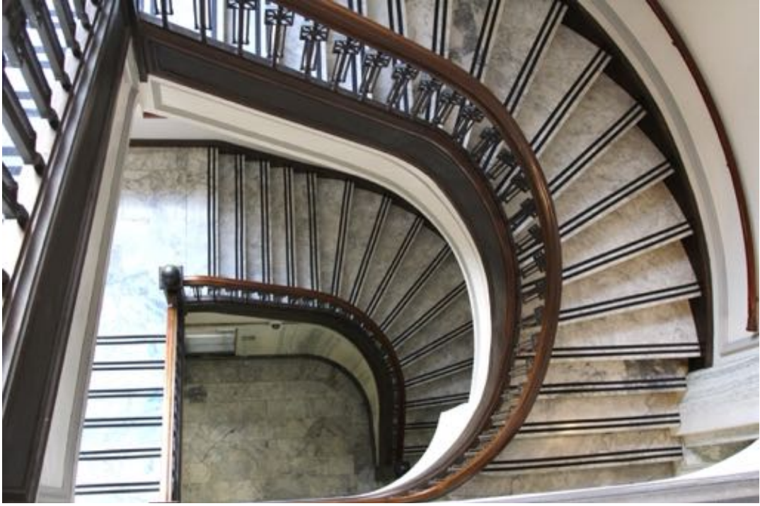
View looking down the grand stairway with a view of the marble steps and detailed handrails.