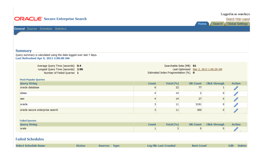
Figure 3: Part of the SES Administration Interface.

An Administration API supports the management of large-scale deployments by providing a command-line interface to administrative tasks previously only available through the SES Admin GUI: