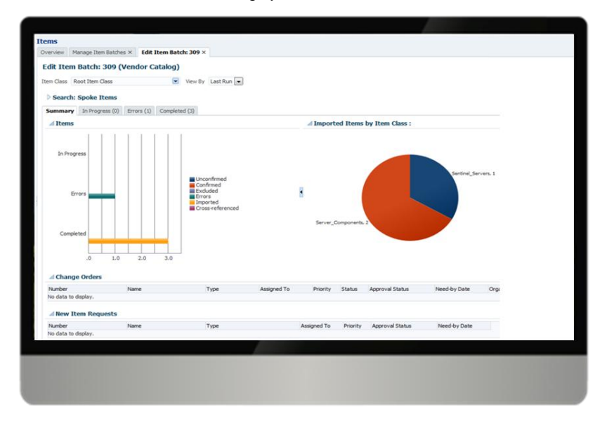
Figure 2. Review and import product data from multiple sources

Once data has been rationalized and consolidated, Oracle Product Hub Cloud provides a rich and extensible data model to maintain all aspects of product data including seeded and user defined attributes, product hierarchies, structures, relationships, and digital asset associations. Furthermore, contextual product data such as those that vary by trading partners, channels, target markets and locations can easily be defined and maintained without creating duplicate product records. Business rule validations ensure that product definitions, regardless of mode of entry, are validated against pre-defined business rules to ensure data integrity.