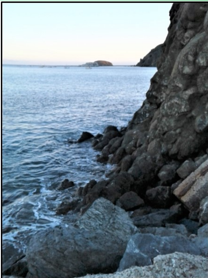
STOP 2 - Pillow Basalts observed at Port San Luis