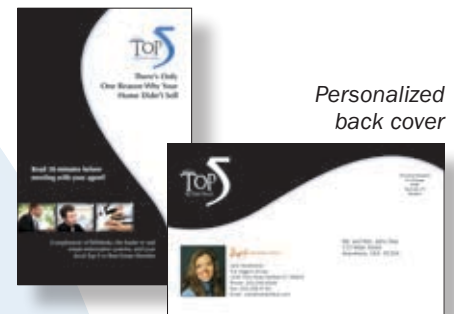
Personalized back cover

Shipping costs: $10.50 for first 100, plus $6.00 for each additional 100