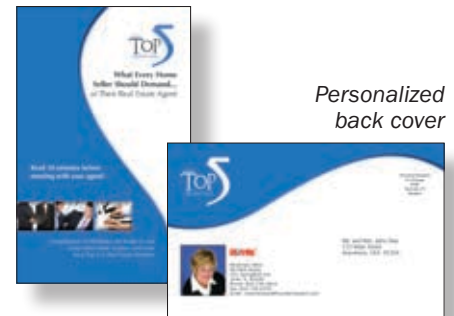
Personalized back cover

Shipping costs: $10.50 for first 100, plus $6.00 for each additional 100