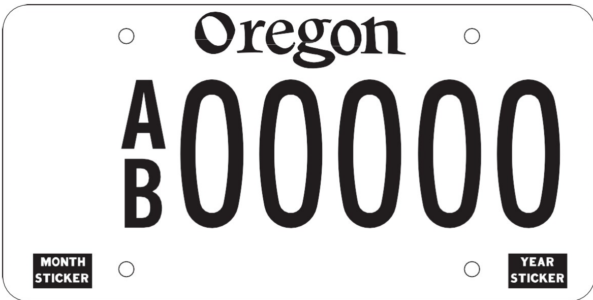
Plate Design Template Option 1

DMV will contact you if your plate design requires changes. If no changes are required or once changes have been incorporated and returned to DMV, DMV's plate manufacturer will create computer-aided design (CAD) drawings of your plate design for your review and approval. Once the CAD drawings are approved, DMV's plate manufacturer will produce actual plate samples. The sample license plates must be approved by authorized representative(s) of your group and law enforcement.