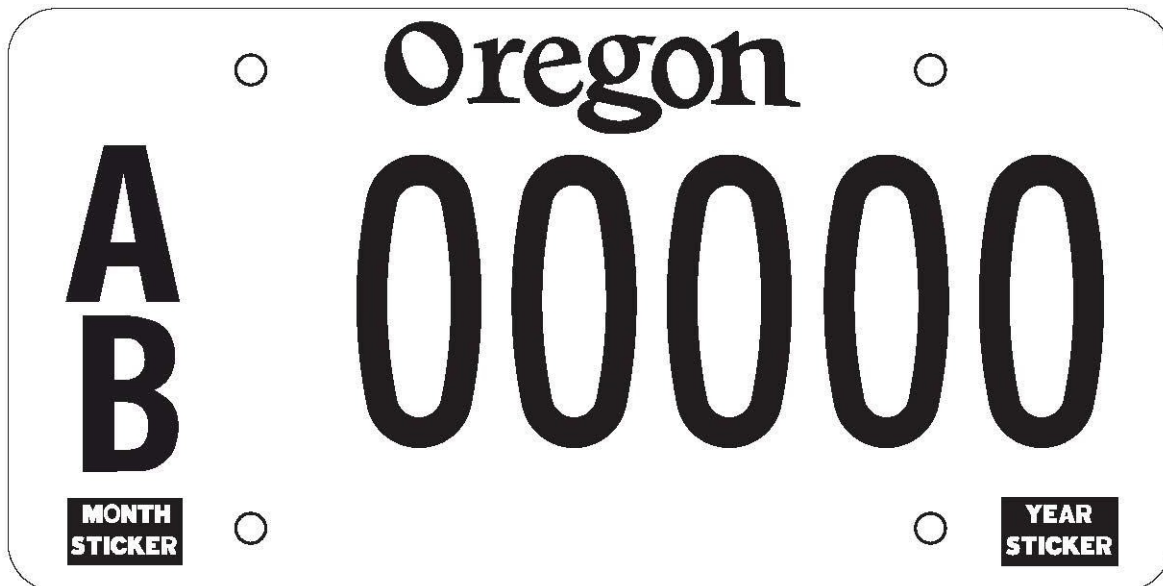
Plate Design Template Option 2

Your plate design must be clear and easy to read. Law enforcement and other emergency personnel rely on registration plates to identify a vehicle in the case of a traffic violation, accident or an emergency. Remember that DMV will consult with law enforcement and the plate manufacturer during the plate review process.