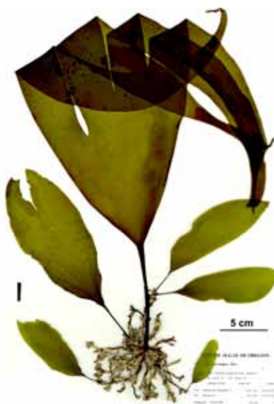
Above: Laminaria longipes , a new midstory kelp from Redfish Rocks