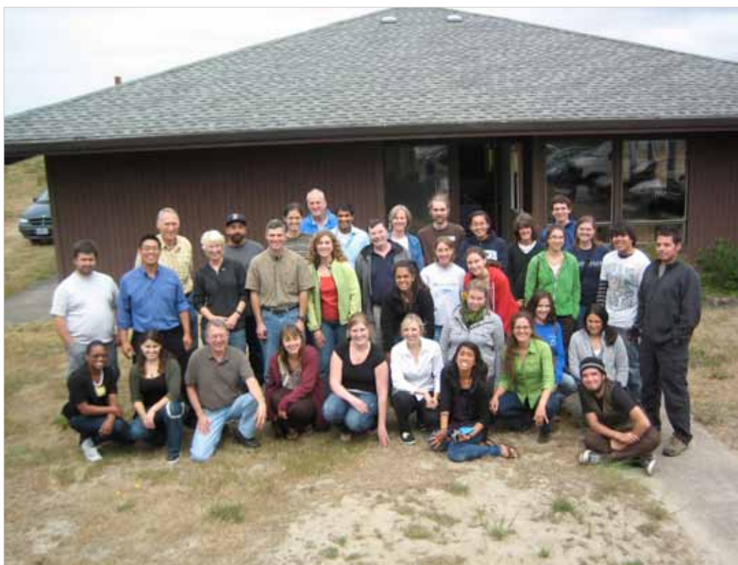
HMSC interns and mentors, summer 2010