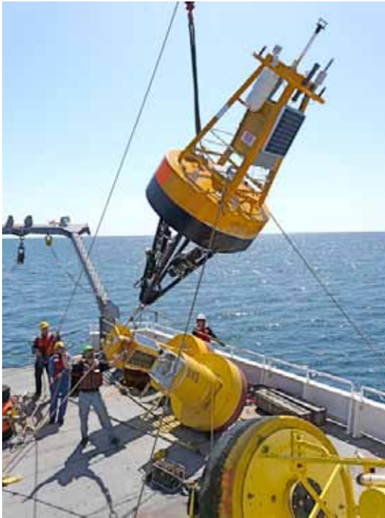
The Multi-Function Node is deployed off of Yaquina Head in support of the Ocean Observation Initiative

Additional information on OSU's Research Vessels can be found at the following website www.shipops.oregonstate.edu/ops/wecoma/