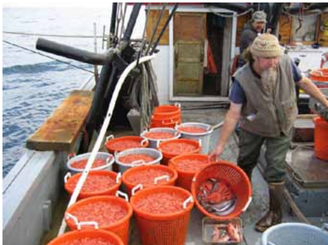
MRP shellfish biologist examines the bycatch from a shrimp trawl.

(such as commercial Dungeness crab and pink shrimp fisheries), the act delegates full authority (in state and federal waters) to state management. States may set overriding fishery regulations as long as they are more conservative than those set in the federal process.