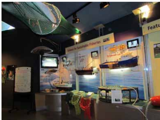
Sustainable Fisheries exhibit

Free-Choice Learning: In its 7 th year, Oregon Sea Grant Extension's Free-Choice Learning Program continues to develop innovative research and education on lifelong free-choice learning. The program at HMSC has grown tremendously from 1 faculty member and 1 graduate student in 2005 to 1 faculty member, 2 research associates, and 9 graduate students doing work at HMSC for 2010-2011. Through its ongoing partnerships with the graduate program in Free-Choice Learning in the College of Science's Department of Science and Mathematics Education, Oregon Sea Grant is using the Hatfield Marine Science Visitor Center and Marine Education programming to carry out research, evaluation, and education in free-choice learning.