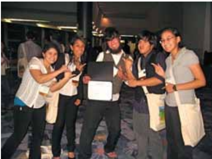
2010 REU students at the SACNAS Conferenc in California

Five of the REU student interns from the Summer 2010 program presented research posters at the February 2011 American Society of Limnology and Oceanography, Aquatic Sciences Meeting in San Juan, Puerto Rico. Seven of the REU student interns presented at the 2010 Society for the Advancement of Chicanos and Native Americans in Science Conference, Anaheim, California.