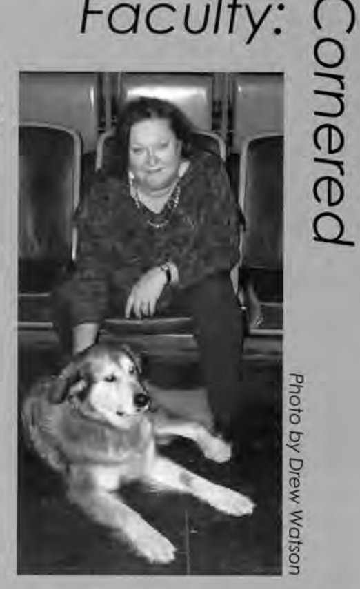
Continued on page 7...