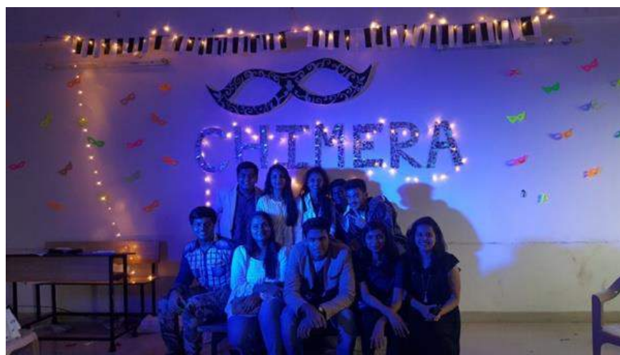
Photo Gallery of Freshers Party