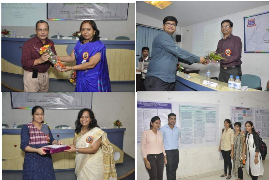
Photo Gallery of seminar entitled “Advances in Analytical Techniques”