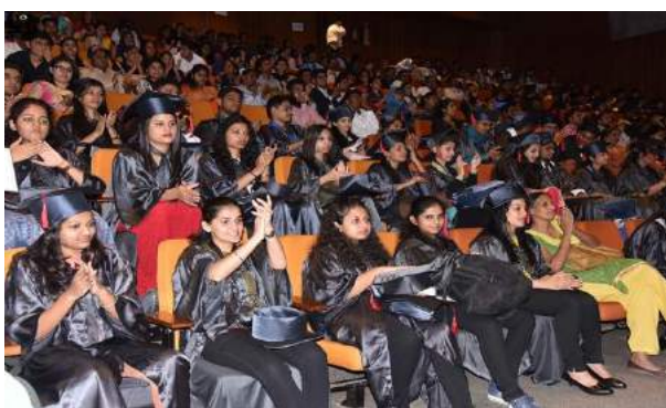
Photo Gallery of Convocation Ceremony