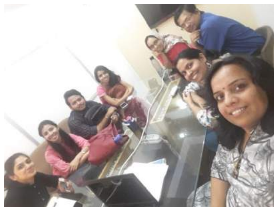
Photo Gallery of Anchrom Industry visit