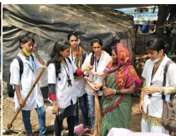
Photo Gallery of Swacch Bharat Mission