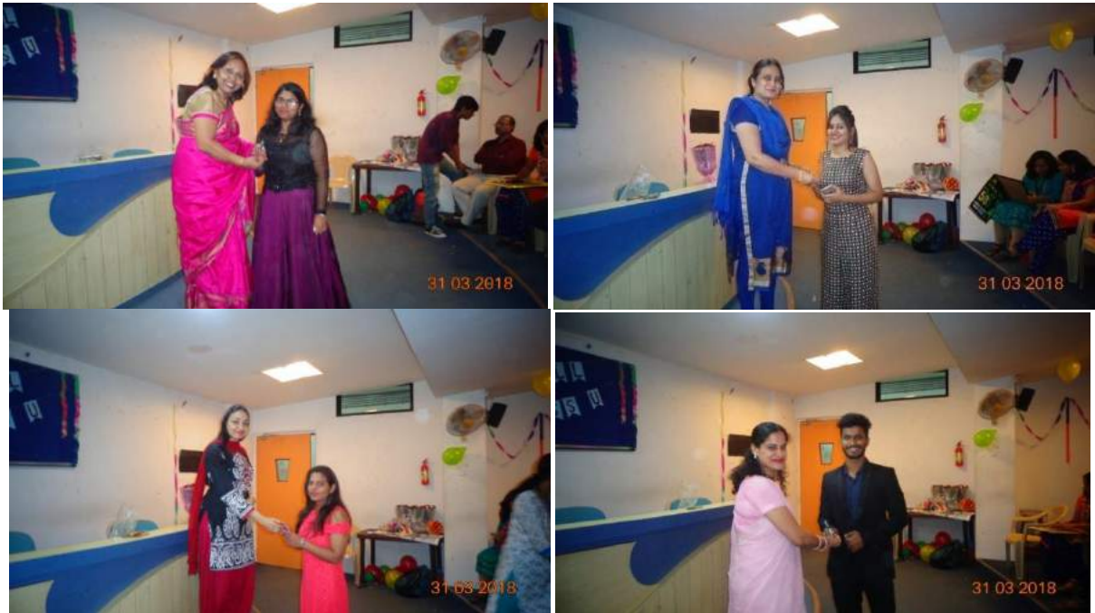
Photo gallery of Farewell Party 2017-18