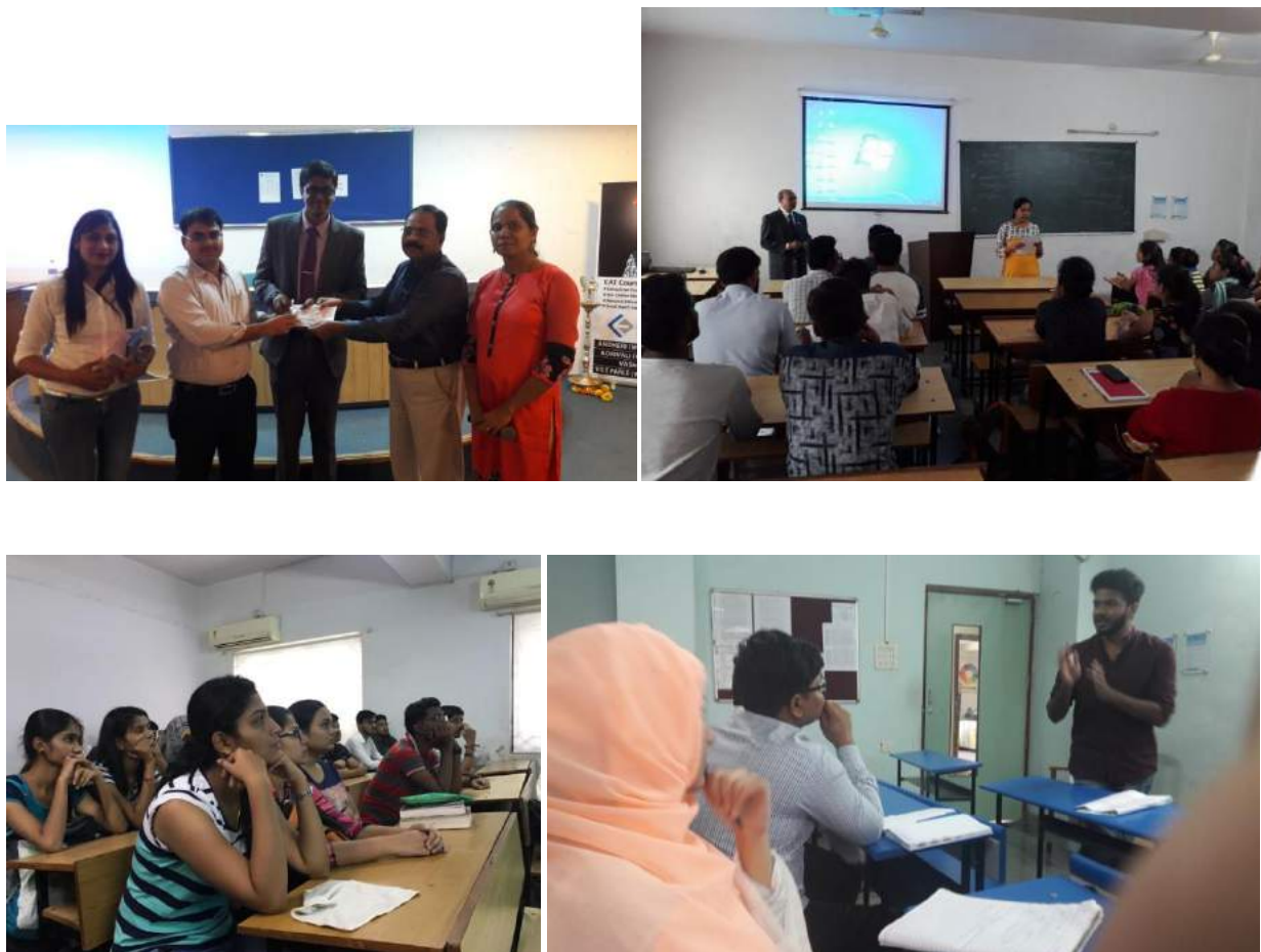
Photo Gallery of Guest Lectures