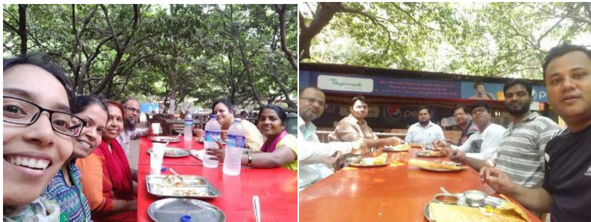
Photo Gallery of Faculty Picnic

6. Teachers Welfare committee organized a picnic for faculty on 10 th May 2018 to Tikuji-Ni-Wadi, Thane . All teachers enjoyed the water slides, rides and had fun throughout the day. This initiative taken by management was highly appreciated.