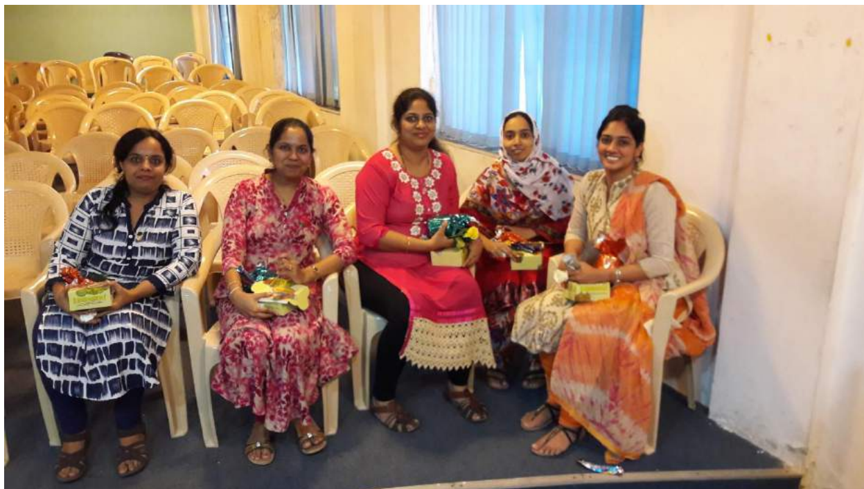
Teachers Day Photo