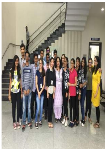
Photo Gallery for Industrial Visit at ACG Associated Capsules, Shirwal