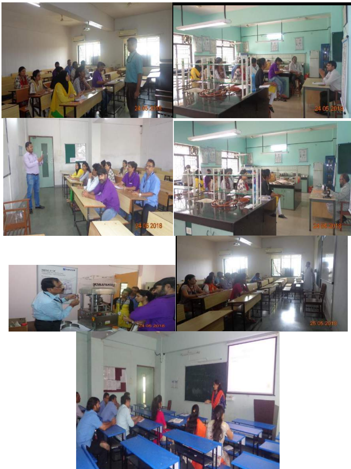
Photo Gallery of QIP for non-teaching staff