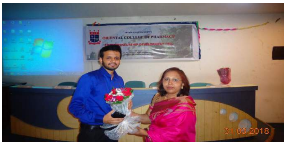
Entrepreneurship Development Cell