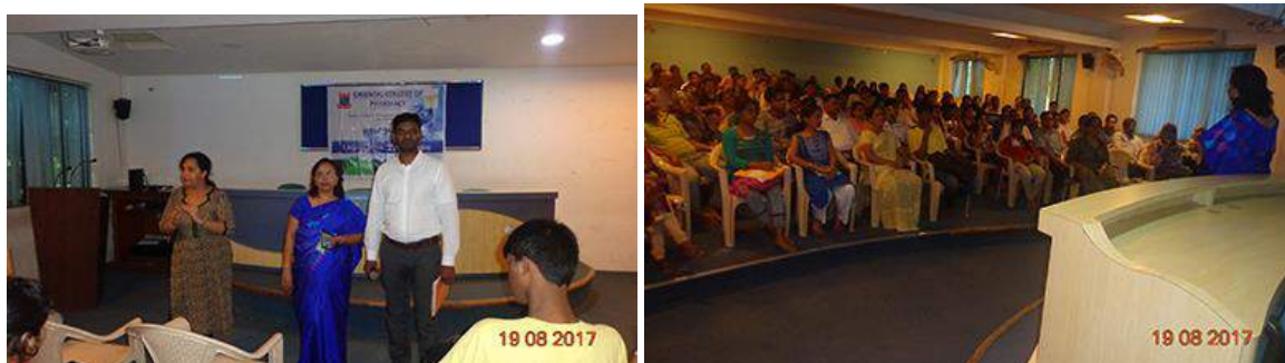
Photo Gallery of Orientation Programme