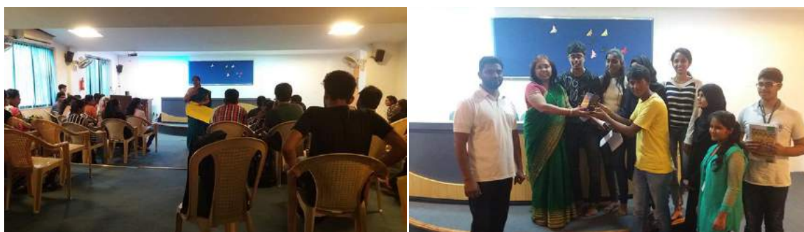
Photo gallery of Personality Development Programme