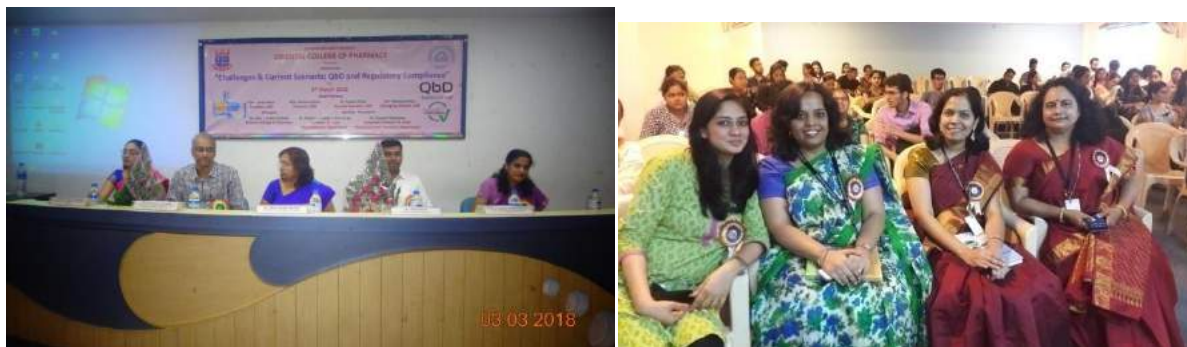
Photo gallery of Seminar entitled 'Challenges & Current Scenario: QbD And Regulatory Compliance'