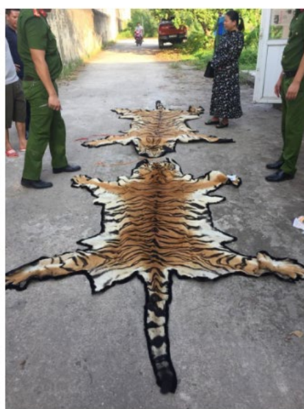
Seizured by Police in Quang Ninh Province, 19 June 2019