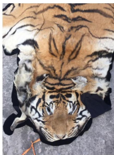
Seizured by Police in Quang Ninh Province, 19 June 2019