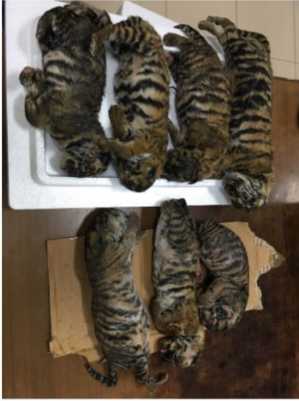
Seized by Police in Ha Noi, 23 July 2019