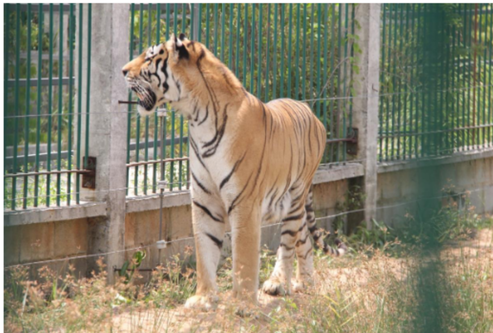
Tiger in My Quynh facility

Vietnam CITES Management Authority has collaborated with the authorities to strictly control the origin of tigers at these facilities. 8 facilities have been granted Management codes or certificates for non-commercial purposes in accordance with Decree No. 06/2019/ND-CP. All tiger specimens at these facilities have original sources such as (i) import and (ii) exchange specimens among zoos by regulations.