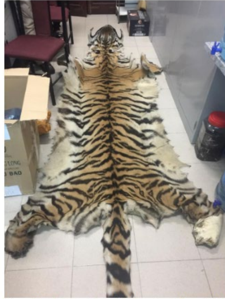
Seized by Police in Quang Ninh Province, 5 August 2019