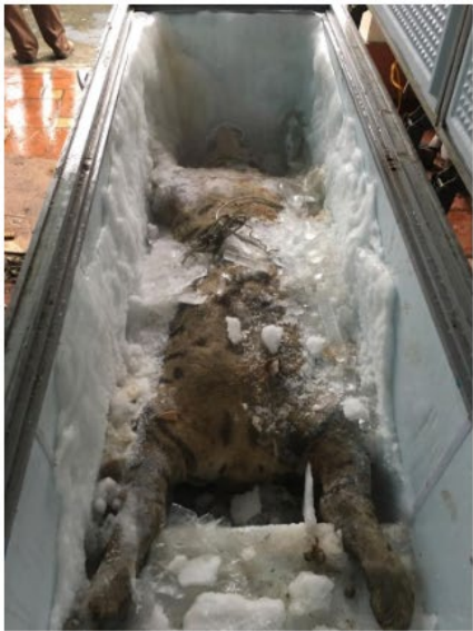
Seized by Police in Thai Nguyen Province 29 May 2019