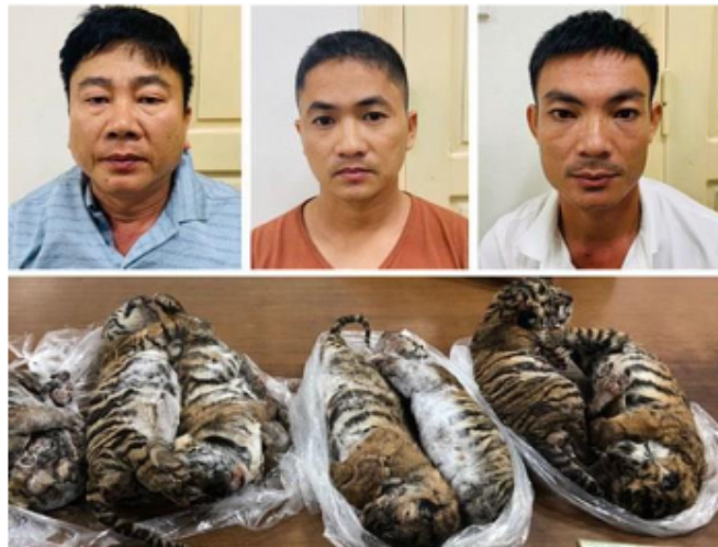
Three suspicion people and exhibits were investigated in Hanoi in July 2019

Vietnam authorities investigated and arrested 31 cases of illegal trafficking, transportation and storage of tiger specimens and big cats (Appendix 1) in the period of 2018-2019. Of which, there were 15 cases of illegal trading, transporting and illegal keeping of tiger specimens (accounting for 48.38% of the total number of arrests). In particular, trading and transportation activities often occur in provinces bordering Laos such as Nghe An. Besides, trading and transporting tiger specimens were also discovered in Hanoi. Most of illegal tiger specimen seized by enforcement agencies were frozen tiger (individual), some skins, such as 07 tiger specimen seized by Hanoi police, the species on the way from Nghe An to Hanoi.