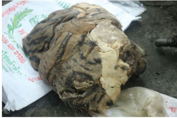
Seizured by Police in Thai Nguyen Province 29 May 2019