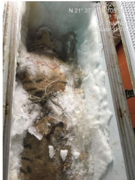
Seized by Police in Thai Nguyen Province 29 May 2019