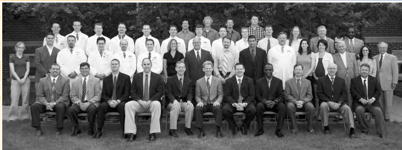
Department faculty, residents, alumni and staff gather during the graduation celebration of 2008.