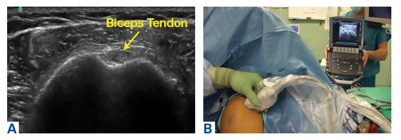
Figure 2. (A) Ultrasound image of the right shoulder. Short axis view of the long head of the biceps tendon as it exits the groove. Yellow arrow indicates the biceps tendon. (B) Photo during surgery showing ultrasound use to localize the biceps tendon as it exits the groove, above the pectoralis major. The biceps tendon is centered on the screen, and the skin is marked to indicate the location of the anteromedial and anterolateral portal for arthroscopic biceps tendoesis.