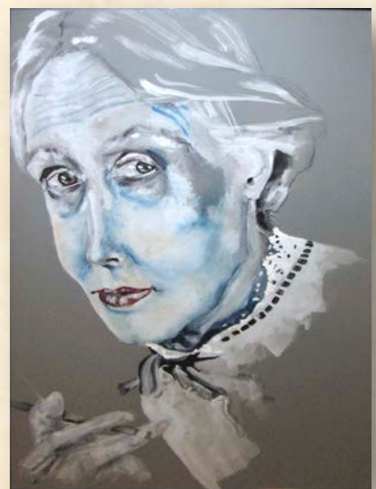
This picture of Virginia Woolf is a watercolor.