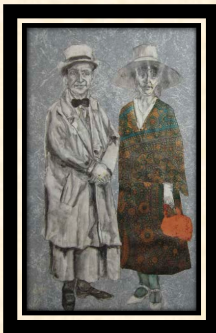
Gertrude Stein and Alice B. Toklas is a collage of pencil drawing with gift wrap.

Marilyn also has a haunting pencil drawing of Georgia O'Keefe, but it didn't photograph too well. You'll have to see it.