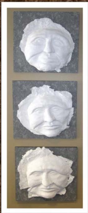
Gertrude Stein is the subject of the series of plaster gauze castings.