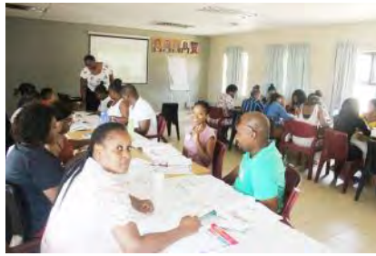
Group discussion during the progress on of training.

-26 employees attended the training which included employees from other hospitals i.e Bethesda and Mseleni hospitals . All Government employees are obligated to undergo CIP after appointment to the public.