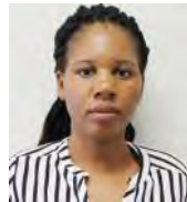
N.O Tembe SCM In-serve