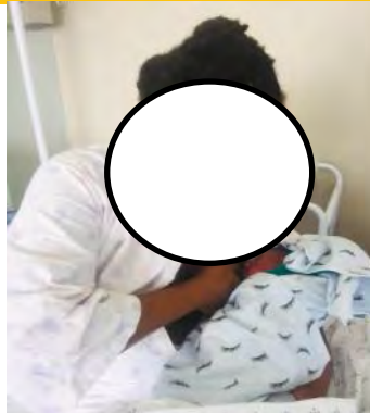
Leap year baby READ MORE ON PAGE 4