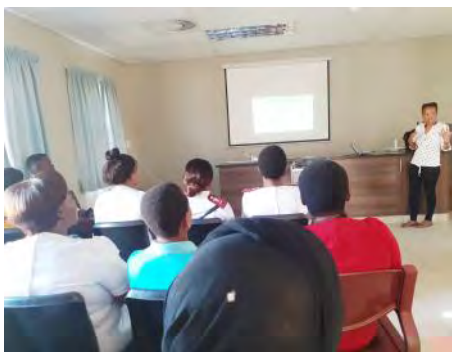
Staff training &updates on COVID-19 READ MORE ON PAGE 2

community engagements and health educations on COVID-19 are being done to ensure that the community is well informed and understand the importance of protecting themselves as well as others.