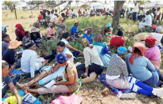
Community health education on COVID-19 before lockdown.

Health educations were conducted in the community of Othobothini . The aim was to precaution the community members about the pandemic which left many people with fear and hopelessness . The facility outreach team had sessions with the community to educate them on the correct methods to prevent the spread of coronavirus. Community members were requested to adhere to the COVID-19 regulations set by the President of S.A Mr Cyril Ramaphosa .