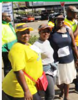
Participants during fun walk

J ozini local Municipality with uMkhanyakude stakeholders embarked on a fun walk of 3km from Sinethezekile to Jozini Mall. The aim was to launch the month of March as the Human Rights Month. The department of health was rendering health services on site. The community was also encouraged to continue utilizing the healthcare facilities.