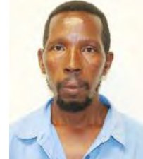
TSL Menyuka EPWP