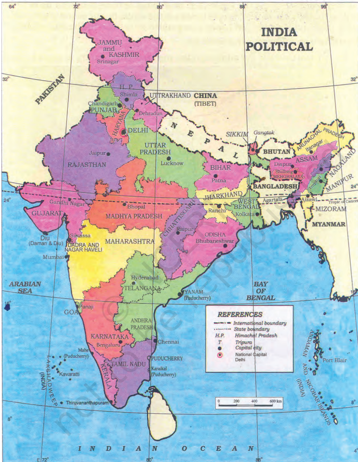
Figure 7.2 : Political map of India

*Telangana became 29th state of India in June 2014