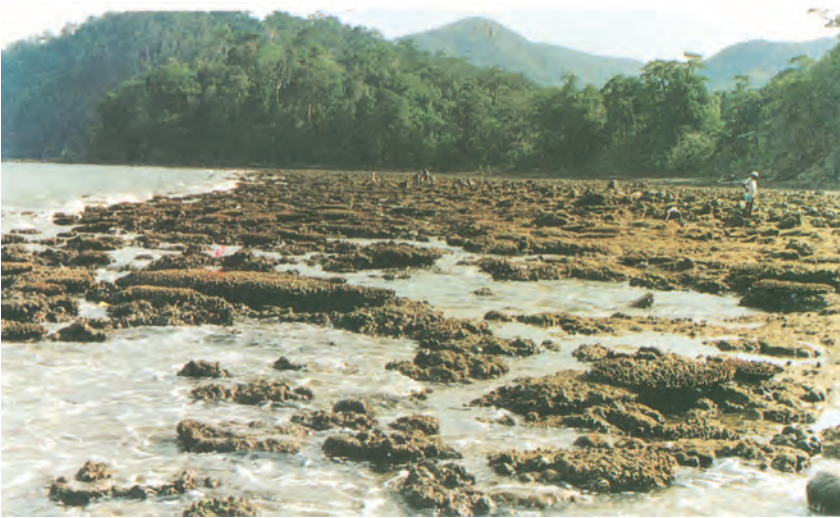
Figure 7.4 : Coral Islands