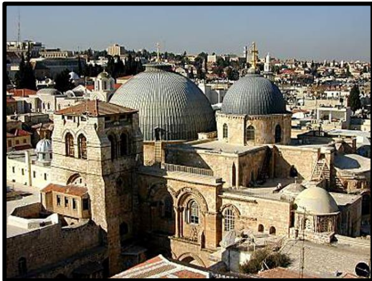
Holy Sepulcher Church,

As a matter of privacy, we do not disclose addresses or other personal information about other travelers in the group. We do all in our power to assure seats for passengers traveling together on aircraft are assigned together, but because airline seating assignments for groups are controlled by the air carrier, we cannot guarantee specific seat assignments. Passengers must be in good health and able to care for their own needs. Please contact us regarding any health concerns you may have or if you need to bring any specialized medical equipment such as wheelchairs, oxygen tanks, C-Pap, etc. so that we can determine if transportation services, hotels, and other suppliers can accommodate your equipment. If it is determined that your equipment can be accommodated, you or your traveling companion are fully responsible for it and must be able to lift, fold, push, and handle the equipment. Tour directors on the trip cannot be of assistance with such needs. We reserve the right to remove passengers from the group at their own expense if the care of or actions of a passenger become detrimental to the functioning of the tour. Payment of deposit(s) as outlined in this agreement shall be deemed consent to be bound by the terms and conditions of this agreement.