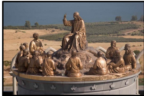
The statues of Jesus and Twelve Apostles in Domus Galilaeae on the Mount of Beatitudes near the Sea of Galilee in Galilee