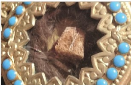
The hair of Saint Mary Magdalene is enclosed behind glass in a golden cross reliquary which resides in the Basilica of Saint Mary Magdalene in the town of St Maximin-la-Sainte-Baume in Provence.

St Mary Magdalene was the first Adorer of the same Lord who remains with us until the end of time in the Eucharistic mystery. We pray that by meditating on all she did for Jesus that our own hearts will become inflamed and transformed.