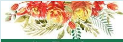
Altar Flower Sign-up