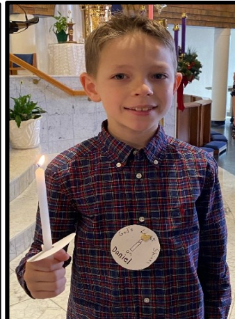
Additional photos First Penance 2021