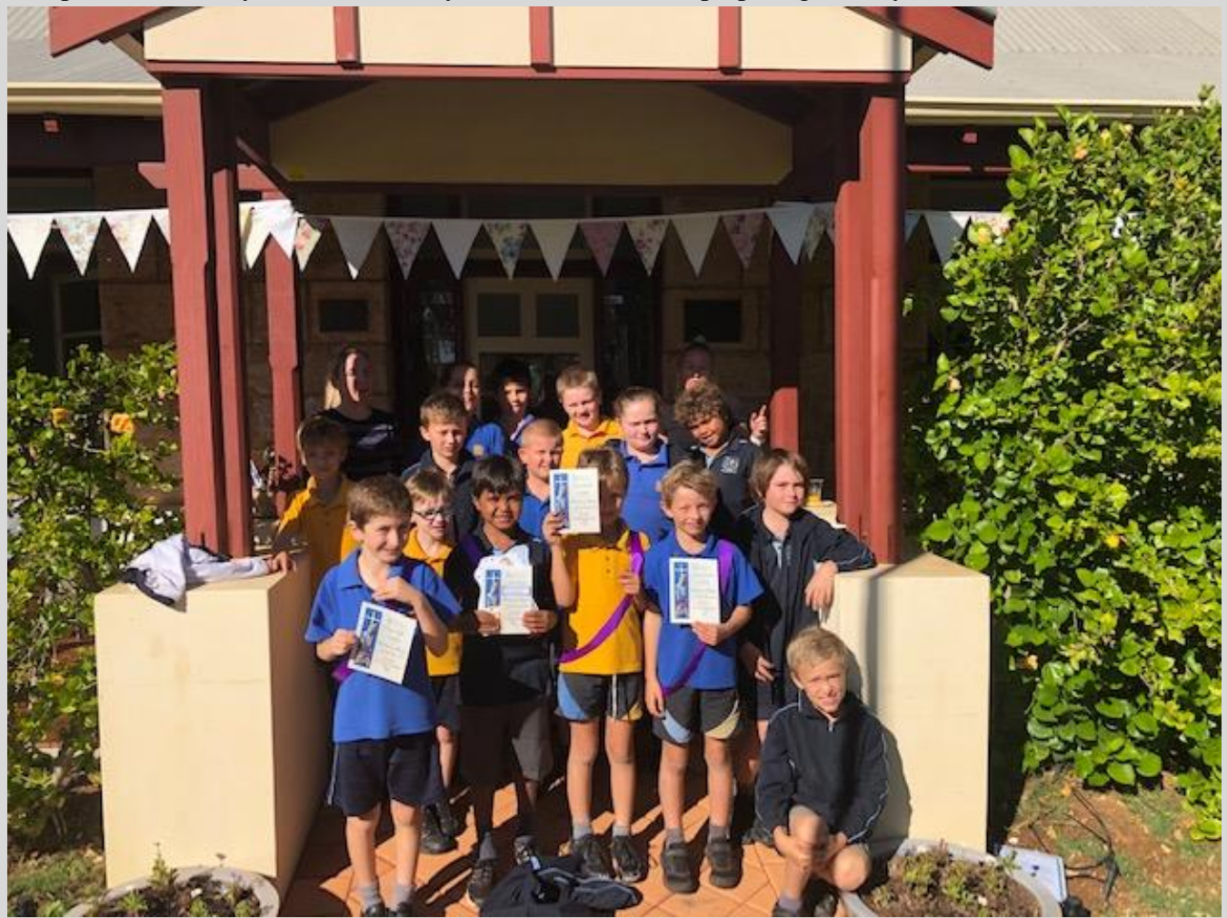
'Love one another, as I have loved you.'