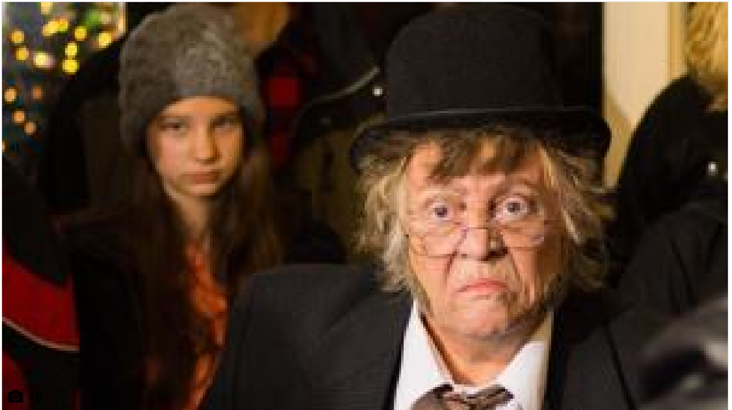
Out and About: Holiday theater continues with interactive Scrooge, naughty Cindy Lou Who

Out and About: Holidays usher in theater, music, festivals