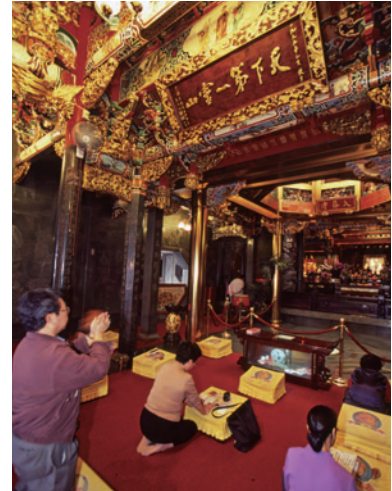
(Left) Catching a glimpse of the mountain and city view while traveling on the cable car. (Right) Zhinan temple is situated in the tranquil atmosphere where worshipper can focus on their inner peace.

for its 1000-step stairs leading to the major palaces.