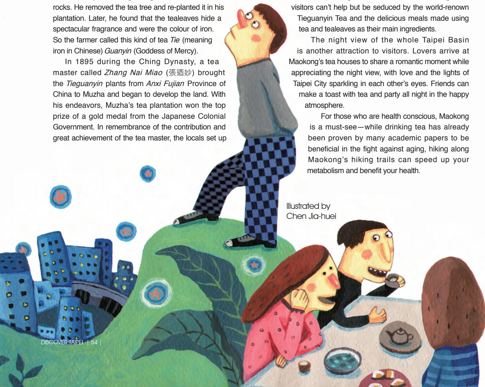
Illustrated by Chen Jia-huei