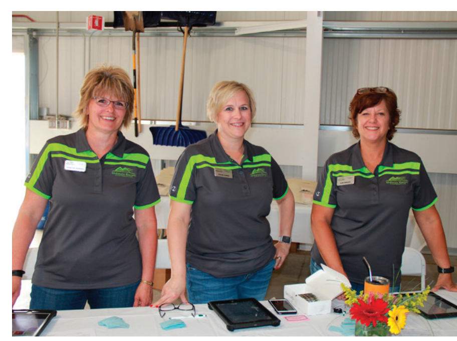
MEC implemented a new electronic registration process.