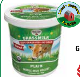
ORGANIC VALLEY Organic Grassmilk Yogurt 24 oz.