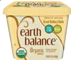
EARTH BALANCE Buttery Sticks or Spread Select varieties, 13-16 oz.