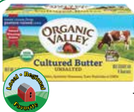
ORGANIC VALLEY Organic Butter Salted or unsalted, 16 oz.