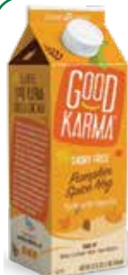
GOOD KARMA Flax Milk Nog 32 oz.