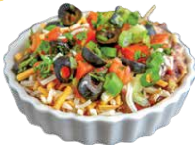
OUTPOST'S OWN Fiesta Taco Dip

Not an owner yet? Stop by Customer Service to learn more about the benefits of ownership!