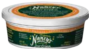
NANCY'S Organic Sour Cream 8 oz.