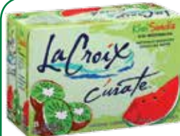
LA CROIX Curate Flavored Sparkling Water 8-pk.