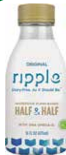
RIPPLE Dairy-Free Half and Half Select varieties, 16 oz.