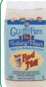
BOB'S RED MILL 1 to 1 Gluten-Free Baking Flour 22 oz.