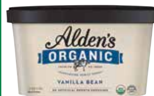
ALDEN'S Organic Ice Cream Select varieties, 48 oz.