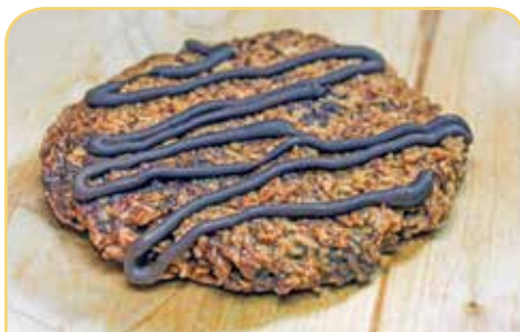
OUTPOST BAKEHOUSE Coconut Cookies