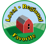
ROTH KÄSE Havarti Dill Cheese