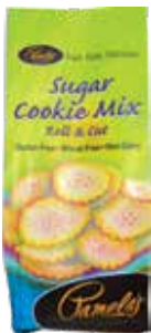
PAMELA'S Gluten-Free Sugar Cookie Mix 13 oz.