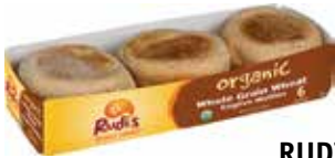
RUDI'S BAKERY Organic English Muffins Select varieties, 12 oz.