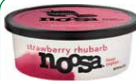
NOOSA Extra Thick Yogurt Select varieties, 8 oz.