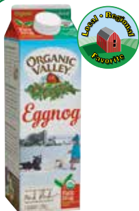
ORGANIC VALLEY Organic Egg Nog 32 oz.