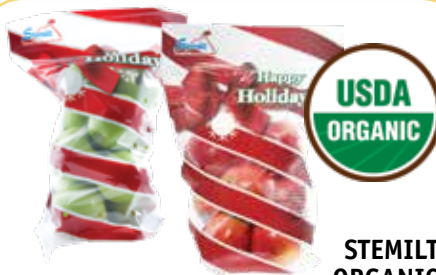
STEMILT ORGANIC BAGGED APPLES Granny Smith or Pink Lady